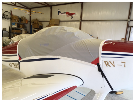
Van's RV-7 Travel Canopy Cover