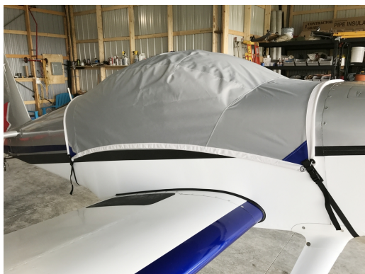
Van's Aircraft RV-9 Travel Cover, Light Weight Travel Canopy Cover

Travel Covers are made with Silver Solution-Dyed Polyester fabric and only lined over the windshield to save weight. The material is lightweight and more compact for easy stowage in the aircraft. The polyester material is water resistant, but only intended for occasional use outside. We also have an ultra lightweight material available for fitted hangar dust covers. For daily outdoor use, the non-travel Sunbrella Cover is the best choice.