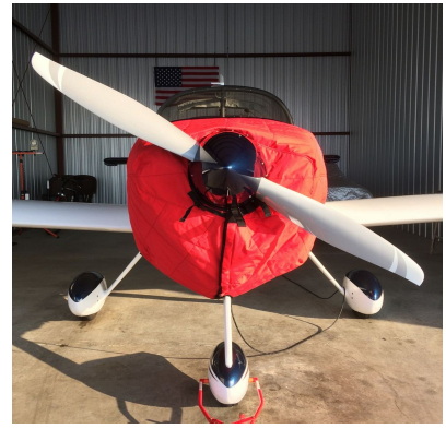
Van's RV-9A Insulated Engine Cover