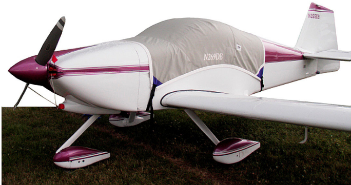
Van's RV-6 Canopy Cover

This cover type is made from Silver Acrylic Sunbrella canvas and is 100% lined with a soft and smooth microfiber. Bruce's Custom Covers developed this material combination especially for aircraft protection. The outer material is medium weight and treated for water resistance, UV resistance and anti-static buildup. The inner lining is a very soft and smooth microfiber to prevent scratching. The material is very reflective, and tests show that the cabin interior temperature can be reduced to near-ambient temperature on the hottest of days. It is water, ice and snow repellent, yet breathable to allow moisture to escape from between the cover and the aircraft surface.