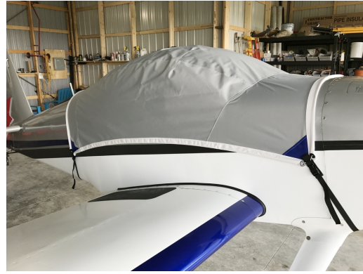
Van's Aircraft RV-9 Travel Cover, Light Weight Travel Canopy Cover