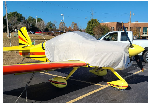
Van's RV-6A Extended Canopy/Engine Cover