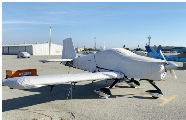
Van's RV-9A Extended Canopy/Engine, Wing & Empennage Covers