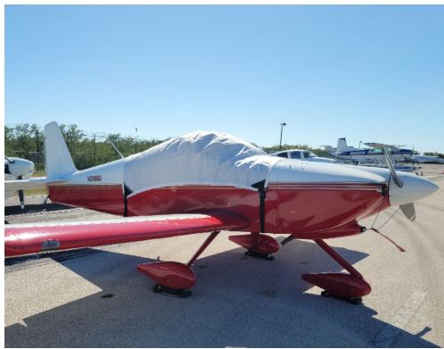
Van's RV-6A Canopy Cover

This cover type is made from Silver Acrylic Sunbrella canvas and is 100% lined with a soft and smooth microfiber. Bruce's Custom Covers developed this material combination especially for aircraft protection. The outer material is medium weight and treated for water resistance, UV resistance and anti-static buildup. The inner lining is a very soft and smooth microfiber to prevent scratching. The material is very reflective, and tests show that the cabin interior temperature can be reduced to near-ambient temperature on the hottest of days. It is water, ice and snow repellent, yet breathable to allow moisture to escape from between the cover and the aircraft surface.