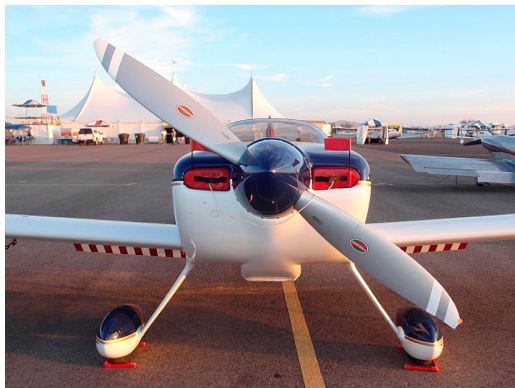
Van's RV-7 Engine Inlet Plugs

Engine Inlet Plugs are custom fit for your Aura Aero Integral R intakes, made with heavy-duty vinyl material, and stuffed with a single block of sculpted urethane foam. Each plug has a zipper that allows the foam to be removed and dried if necessary. Engine plugs have warning flags that are visible from the cockpit or 'remove before flight' streamers sewn onto the face of the plugs. Most plugs are imprinted with the aircraft registration number in black for an extra charge. Storage bag NOT included. Engine plugs may be inserted after flight when the engine is still warm. Engine Inlet Plugs are commonly referred to as Cowl Plugs, Intake Plugs, Cowl Blocks, Engine Blocks, and Engine Bungs.