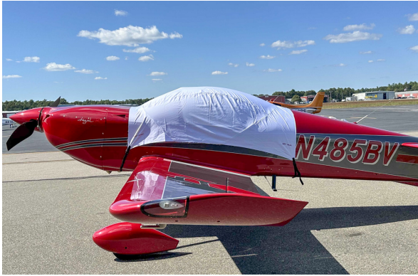
Aura Aero Integral R Canopy Cover, test fit cover

Travel Covers are made with Silver Solution-Dyed Polyester fabric and only lined over the windshield to save weight. The material is lightweight and more compact for easy stowage in the aircraft. The polyester material is water resistant, but only intended for occasional use outside. We also have an ultra lightweight material available for fitted hangar dust covers. For daily outdoor use, the non-travel Sunbrella Cover is the best choice.