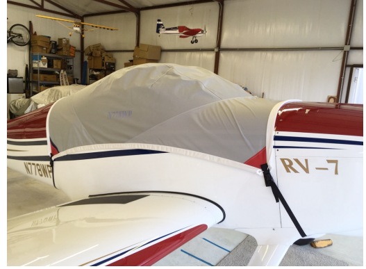
Van's RV-7 Travel Canopy Cover