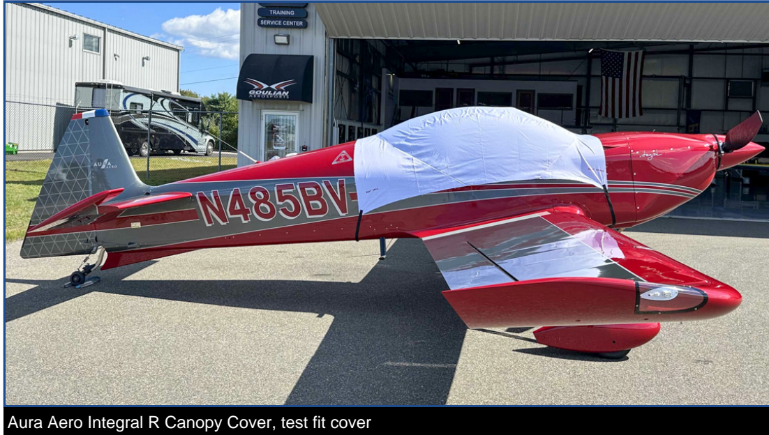
Aura Aero Integral R Canopy Cover, test fit cover