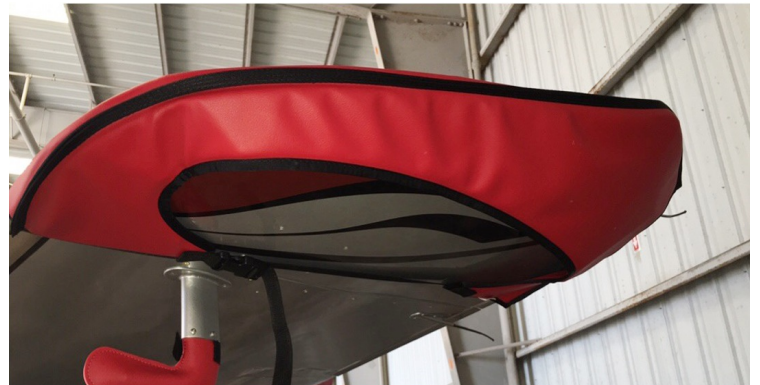
Cirrus SR-20/22 Wingtip Pads