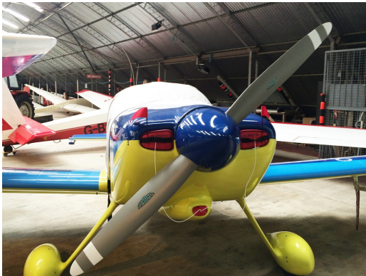
Van's RV-6 Engine Inlet Plugs

Engine Inlet Plugs are custom fit for your Aura Aero Integral R intakes, made with heavy-duty vinyl material, and stuffed with a single block of sculpted urethane foam. Each plug has a zipper that allows the foam to be removed and dried if necessary. Engine plugs have warning flags that are visible from the cockpit or 'remove before flight' streamers sewn onto the face of the plugs. Most plugs are imprinted with the aircraft registration number in black for an extra charge. Storage bag NOT included. Engine plugs may be inserted after flight when the engine is still warm. Engine Inlet Plugs are commonly referred to as Cowl Plugs, Intake Plugs, Cowl Blocks, Engine Blocks, and Engine Bungs.