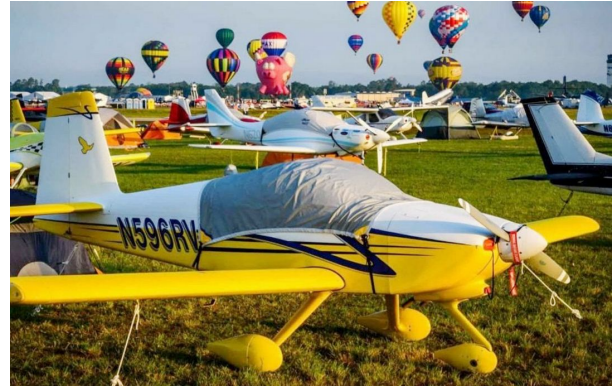
Vans's RV-9 Travel Weight Canopy Cover at Sun 'n Fun