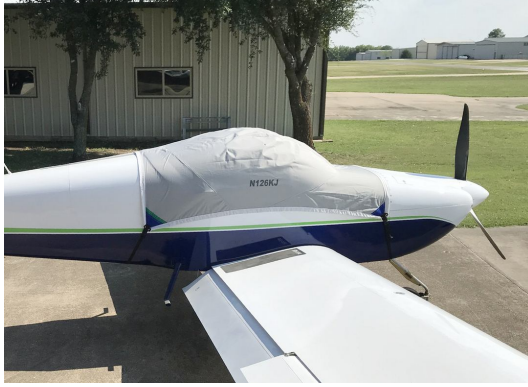
Van's RV-9A Travel Weight Canopy Cover

Travel Covers are made with Silver Solution-Dyed Polyester fabric and only lined over the windshield to save weight. The material is lightweight and more compact for easy stowage in the aircraft. The polyester material is water resistant, but only intended for occasional use outside. We also have an ultra lightweight material available for fitted hangar dust covers. For daily outdoor use, the non-travel Sunbrella Cover is the best choice.