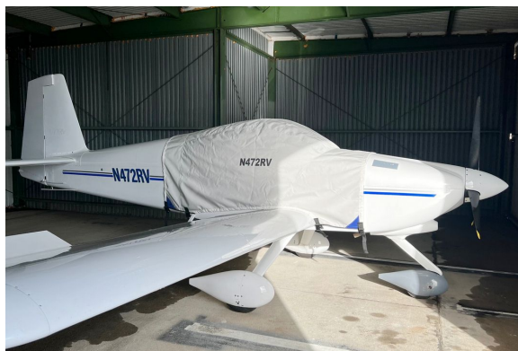
Vans RV-9A Extended Canopy Cover