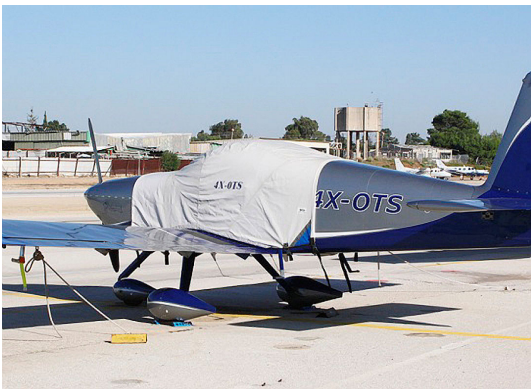
Van's RV-9A Extended Canopy Cover