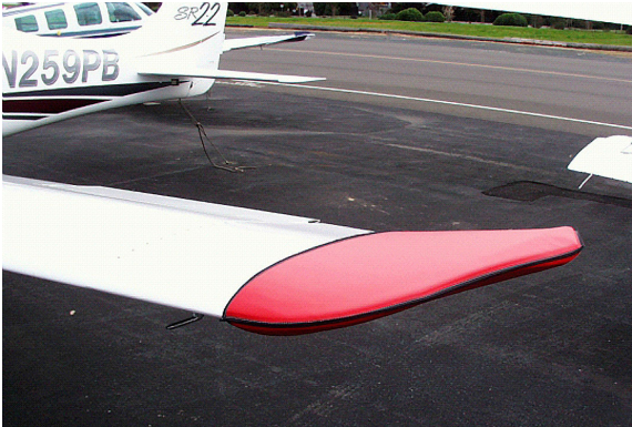
Cirrus SR-22 Wingtip Pad (also available for the Horiz. Stab.)

Designed to prevent damage to the aircraft extremities in crowded hangars, these products are made of bright red Naugahyde and thickly padded with a sandwich of closed cell foam.