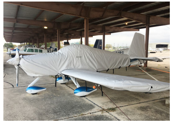
Van's RV-7A Complete Cover Set