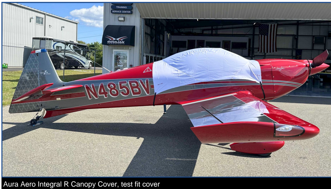
Aura Aero Integral R Canopy Cover, test fit cover