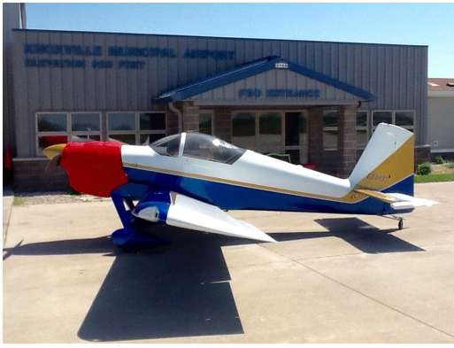
Van's RV-7 Insulated Engine Cover