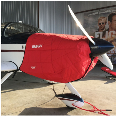
Van's RV-9A Insulated Engine Cover