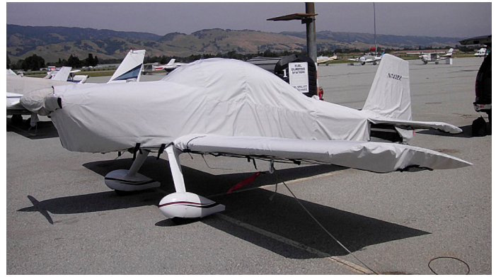
Van's RV-8 Complete Fuselage Cover w/ Detachable Wing Covers & Prop Cover