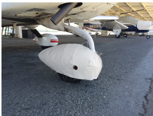
Grumman AA5 Nose Wheelpant Cover, test fit

ALL-YEAR USE MATERIAL - Made with Silver Acrylic Sunbrella canvas, the all-year use material is the best option for sun protection and cover longevity. This heavier more durable material is intended for all weather conditions, such as rain and snow or lots of sun.