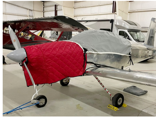
Vans RV-7 Travel Canopy Cover, Hangar Blanket