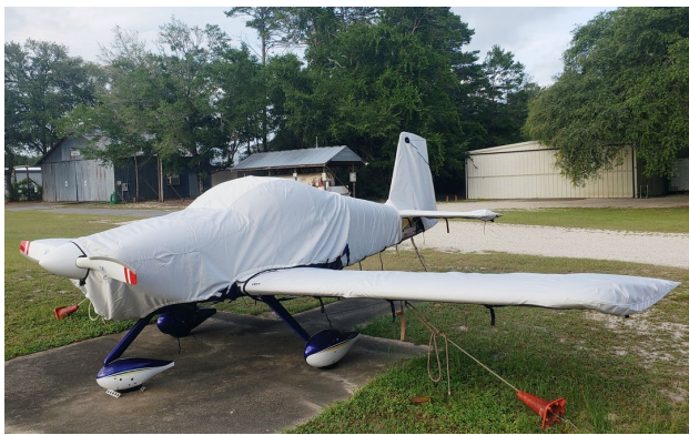
Van's RV-7A Cover Set