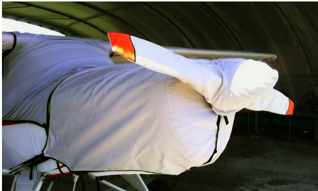
Auster J5 Canopy, Engine, and Propellor Covers