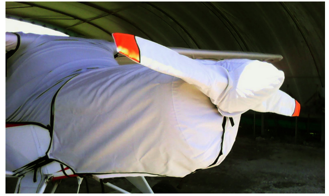
Auster J5 Canopy, Engine, and Propellor Covers