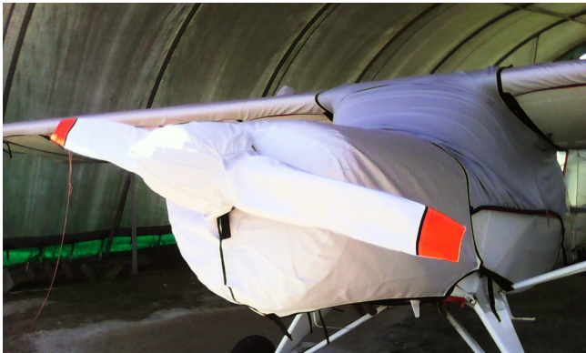
Auster J5 Canopy, Engine, and Propellor Covers