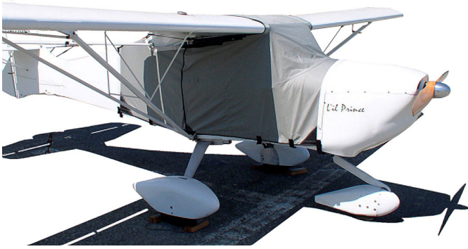
Avid Flyer Extended Canopy Cover