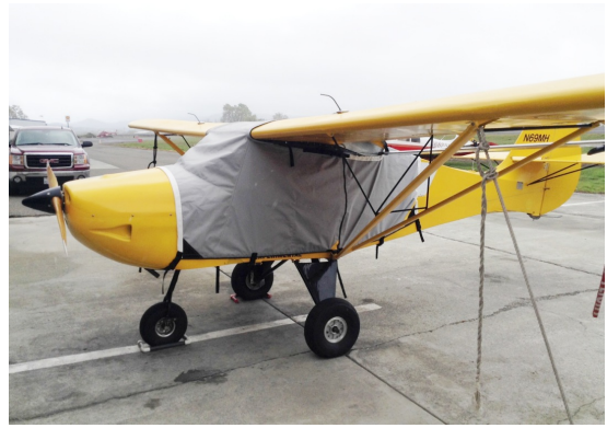
Avid Flyer Extended Canopy Cover