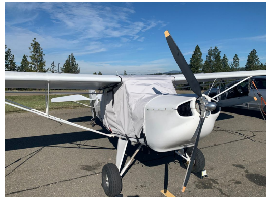
Avid Heavy Hauler MK 4 Over The Top Style Canopy Cover