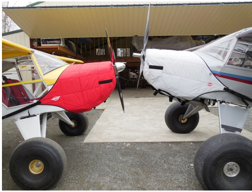
Avid Insulated Engine Covers