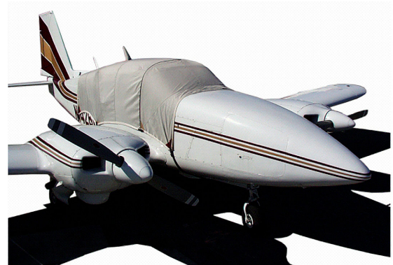
Aztec Canopy Cover