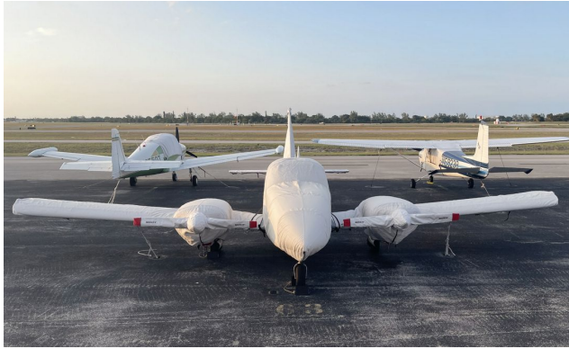
Piper Aztec Complete Cover Set

This cover type is made from Silver Acrylic Sunbrella canvas and is 100% lined with a soft and smooth microfiber. Bruce's Custom Covers developed this material combination especially for aircraft protection. The outer material is medium weight and treated for water resistance, UV resistance and anti-static buildup. The inner lining is a very soft and smooth microfiber to prevent scratching. The material is very reflective, and tests show that the cabin interior temperature can be reduced to near-ambient temperature on the hottest of days. It is water, ice and snow repellent, yet breathable to allow moisture to escape from between the cover and the aircraft surface.