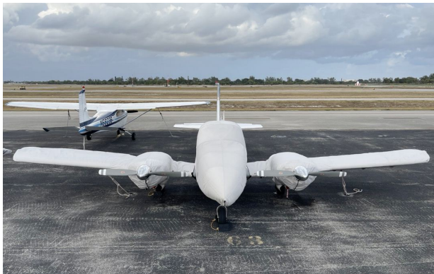
Piper Aztec Extended Canopy/Nose & Wing/Engine Covers

WINTER USE MATERIAL - Made with Solution-Dyed Polyester fabric, this option is intended for seasonal use to aid in deicing, rain mitigation, or for occasional travel. The material is lighter and more compact, but more susceptible to UV damage and may have a shorter useful life if used continuously outside than the all-year use material.