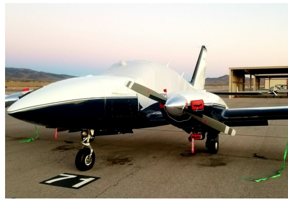
Piper Aztec Canopy Cover & Engine Plugs