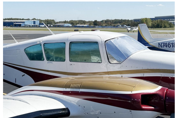
Piper Aztec HeatShields