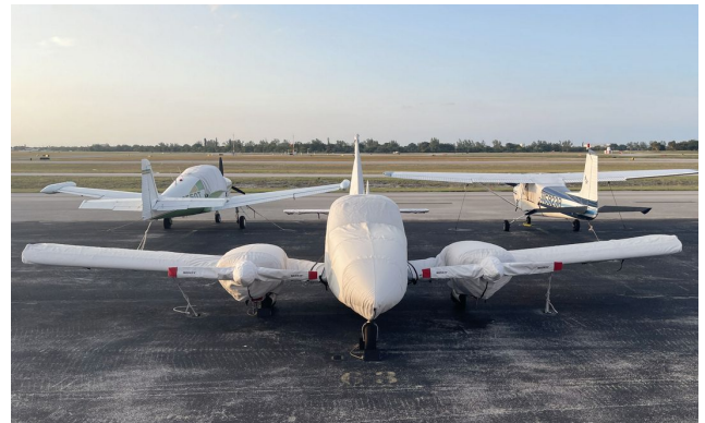
Piper Aztec Complete Cover Set