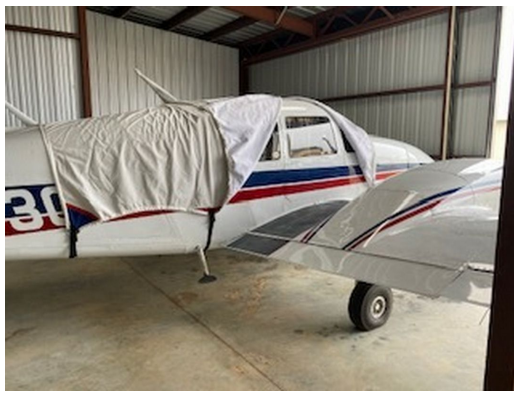
Piper PA-23 Aztec Canopy cover