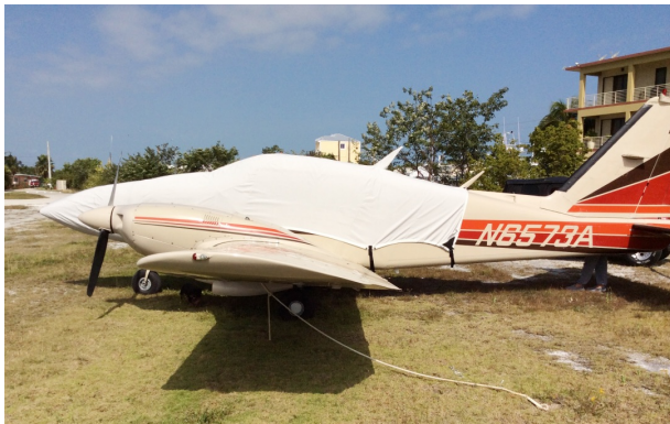
Piper Aztec Canopy/Nose Cover

Travel Covers are made with Silver Solution-Dyed Polyester fabric and only lined over the windshield to save weight. The material is lightweight and more compact for easy stowage in the aircraft. The polyester material is water resistant, but only intended for occasional use outside. We also have an ultra lightweight material available for fitted hangar dust covers. For daily outdoor use, the non-travel Sunbrella Cover is the best choice.