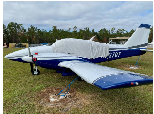
Piper PA-23-250 Aztec Canopy cover