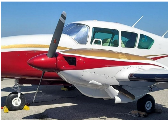
Piper Aztec Windshield HeatShield

Windshield Heatshields are interior sunshades for an aircraft's front windshield. The product is a unique composite of closed-cell foam with a silver mylar finish. The semi-rigid design is stiff enough to stand along the inside of the windshield using sun visors or window framing. It folds up flat and easily stores in the included storage sleeve. Some designs may require velcro and suction cups or split right and left sides. A Heatshield is an excellent short-term remedy for cockpit overheating. An external fabric cover is far more effective and practical for long-term protection.