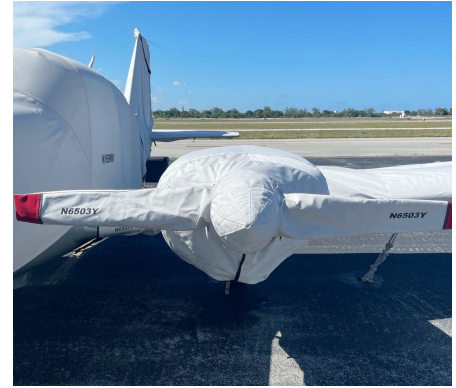
Piper Aztec Propellor Cover