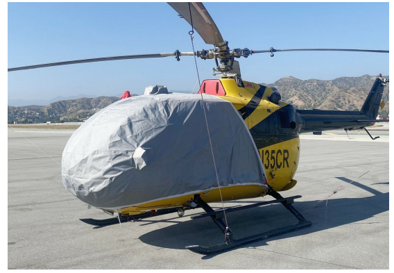
Eurocopter BO-105 Bubble Cover, Standard Model