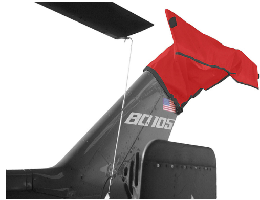
MBB BO-105 Tail Rotor/Gearbox Cover