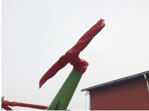
MBB BO-105 Tail Rotor Covers

WINTER USE MATERIAL - Made with Solution-Dyed Polyester fabric, this option is intended for seasonal use to aid in deicing, rain mitigation, or for occasional travel. The material is lighter and more compact, but more susceptible to UV damage and may have a shorter useful life if used continuously outside than the all-year use material.