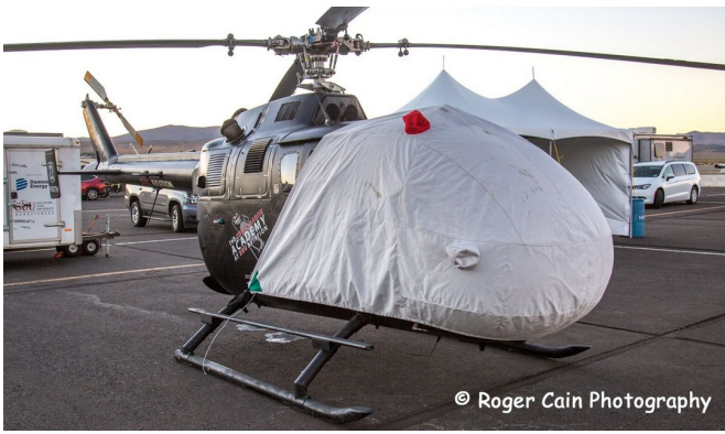
MBB BO-105 Bubble Cover