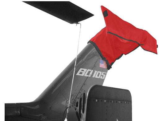
MBB BO-105 Tail Rotor/Gearbox Cover