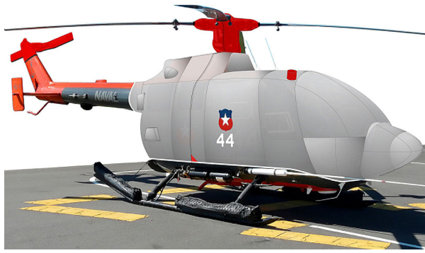
MBB BO-105 Full Body, Rotor Mast & Tail Rotor Covers (illustration)