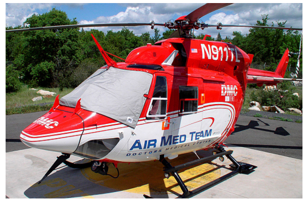
BK-117 Windshield Cover