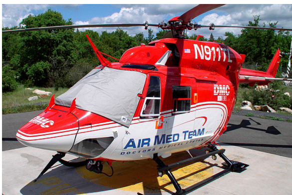
BK-117 Windshield Cover