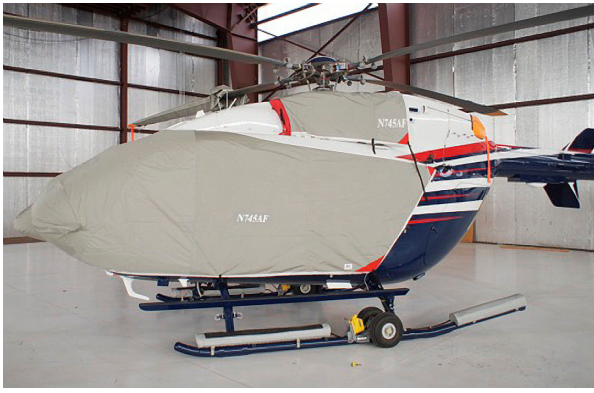
Bubble Cover w/ nose mounted radome, Upper Deck Plugs/Cover