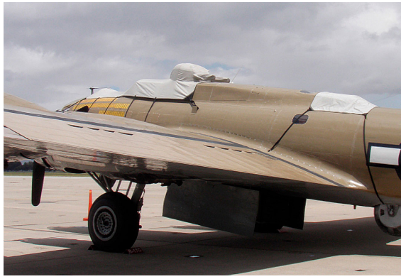
B-17 Canopy/Gun Turret Cover & Hatch Cover