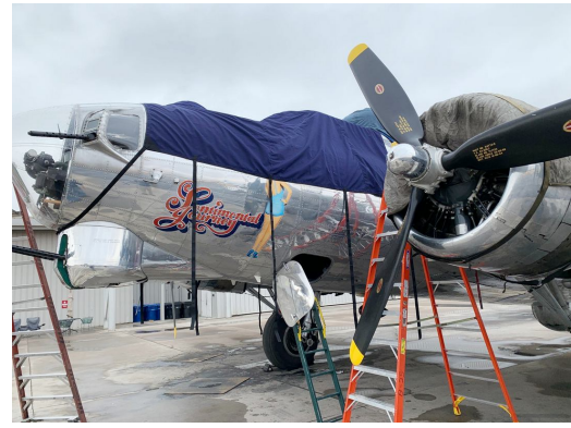
Boeing B-17 Canopy Cover