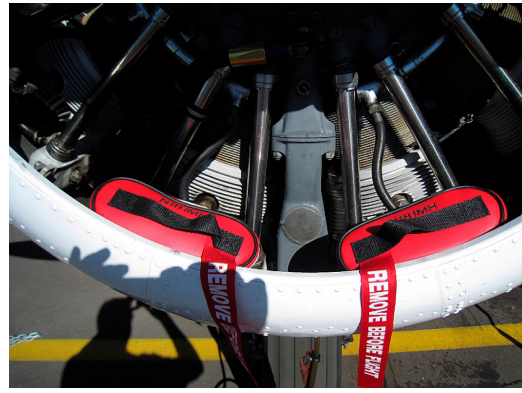
Beech 18 Carb Air Inlet Plugs