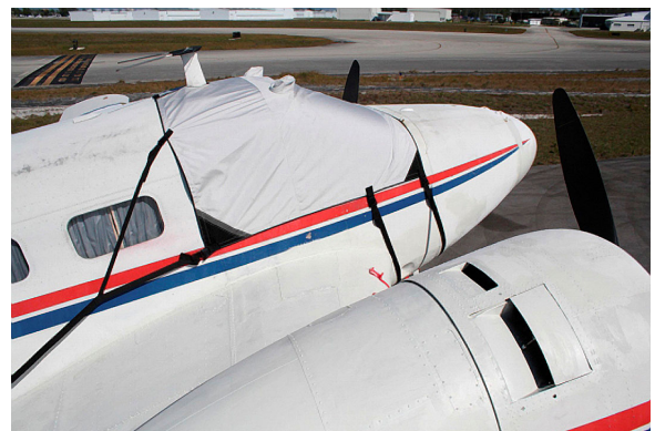
Beech 18 Cockpit Cover