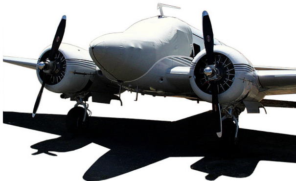
Beech 18 Cockpit/Nose Cover

Travel Covers are made with Silver Solution-Dyed Polyester fabric and only lined over the windshield to save weight. The material is lightweight and more compact for easy stowage in the aircraft. The polyester material is water resistant, but only intended for occasional use outside. We also have an ultra lightweight material available for fitted hangar dust covers. For daily outdoor use, the non-travel Sunbrella Cover is the best choice.