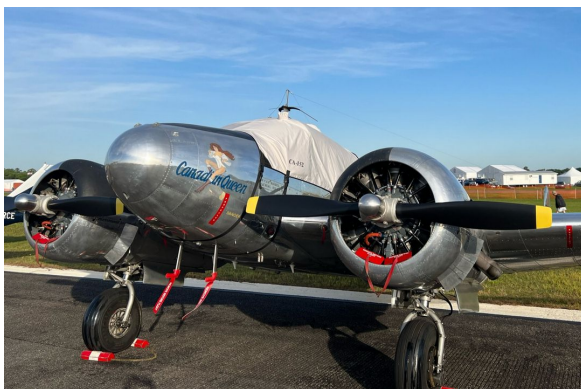
Beech B18 Cockpit Cover

This cover type is made from Silver Acrylic Sunbrella canvas and is 100% lined with a soft and smooth microfiber. Bruce's Custom Covers developed this material combination especially for aircraft protection. The outer material is medium weight and treated for water resistance, UV resistance and anti-static buildup. The inner lining is a very soft and smooth microfiber to prevent scratching. The material is very reflective, and tests show that the cabin interior temperature can be reduced to near-ambient temperature on the hottest of days. It is water, ice and snow repellent, yet breathable to allow moisture to escape from between the cover and the aircraft surface.