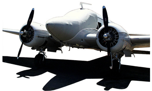
Beech 18 Cockpit/Nose Cover