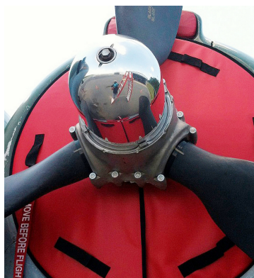
C-46 Radial Engine Intake Plug