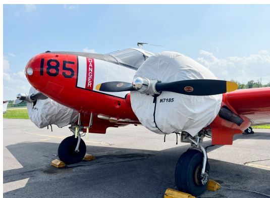
Beech 18 Engine Covers, non-insulated