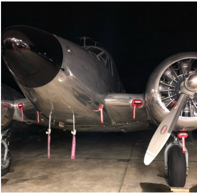
Beech 18 Engine & Oil Cooler Inlet Plugs