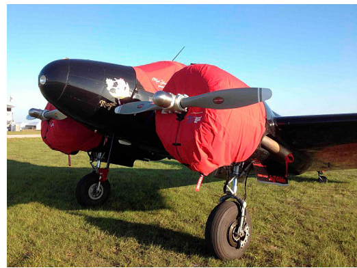
Beech D-18 Engine Covers, Center Section Oil Cooler Inlet Plugs, and Twin Beech 18 Cockpit & Engine Covers, Younkin Airshow model Pitot Covers