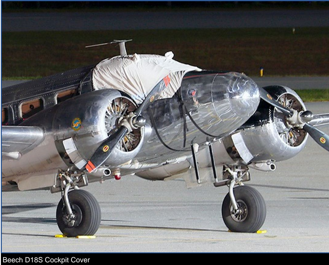
Beech D18S Cockpit Cover