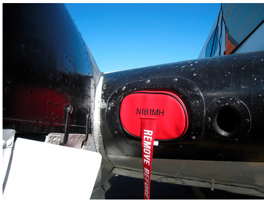
Beech 18 Oil Cooler Center Section Inlet Plugs