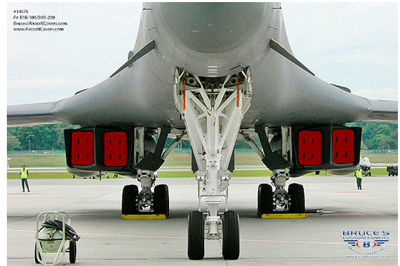
B1-B Bomber Intake Plugs