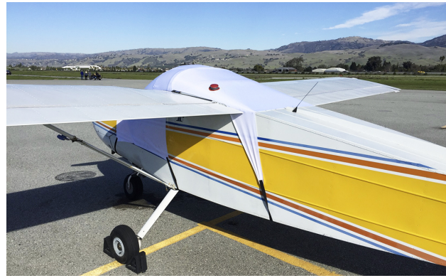
Bolkow Junior 208 Canopy Cover (test fit)