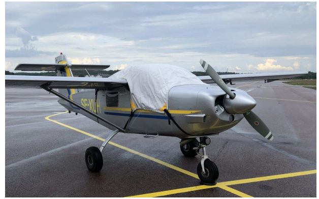
Saab Safari Canopy Cover