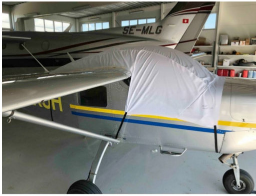
Saab Safari Canopy Cover, test fit cover