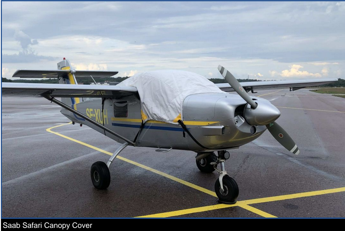
Saab Safari Canopy Cover