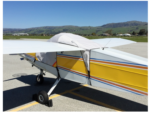
Bolkow Junior 208 Canopy Cover