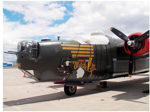
Cockpit/Gun Turret Cover