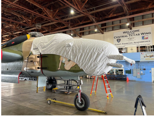
North American B-25N Cockpit/Nose Cover

This cover type is made from Silver Acrylic Sunbrella canvas and is 100% lined with a soft and smooth microfiber. Bruce's Custom Covers developed this material combination especially for aircraft protection. The outer material is medium weight and treated for water resistance, UV resistance and anti-static buildup. The inner lining is a very soft and smooth microfiber to prevent scratching. The material is very reflective, and tests show that the cabin interior temperature can be reduced to near-ambient temperature on the hottest of days. It is water, ice and snow repellent, yet breathable to allow moisture to escape from between the cover and the aircraft surface.