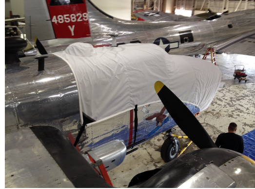
B25 Cockpit/Nose Cover