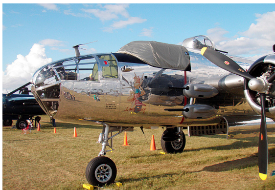
Mitchell B25 Cockpit Cover (Snap-On Type)

This cover type is made from Silver Acrylic Sunbrella canvas and is 100% lined with a soft and smooth microfiber. Bruce's Custom Covers developed this material combination especially for aircraft protection. The outer material is medium weight and treated for water resistance, UV resistance and anti-static buildup. The inner lining is a very soft and smooth microfiber to prevent scratching. The material is very reflective, and tests show that the cabin interior temperature can be reduced to near-ambient temperature on the hottest of days. It is water, ice and snow repellent, yet breathable to allow moisture to escape from between the cover and the aircraft surface.