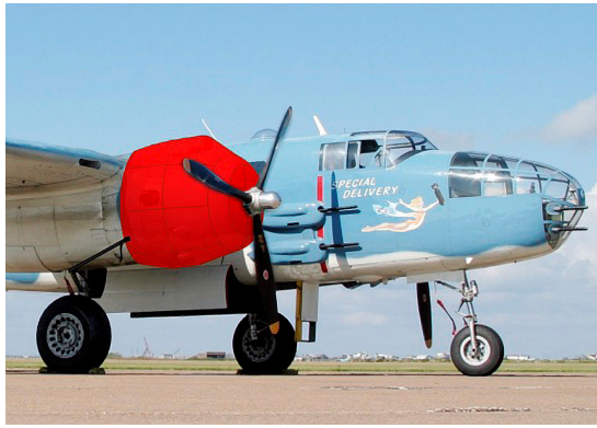
B25 Engine Cover, Illustration