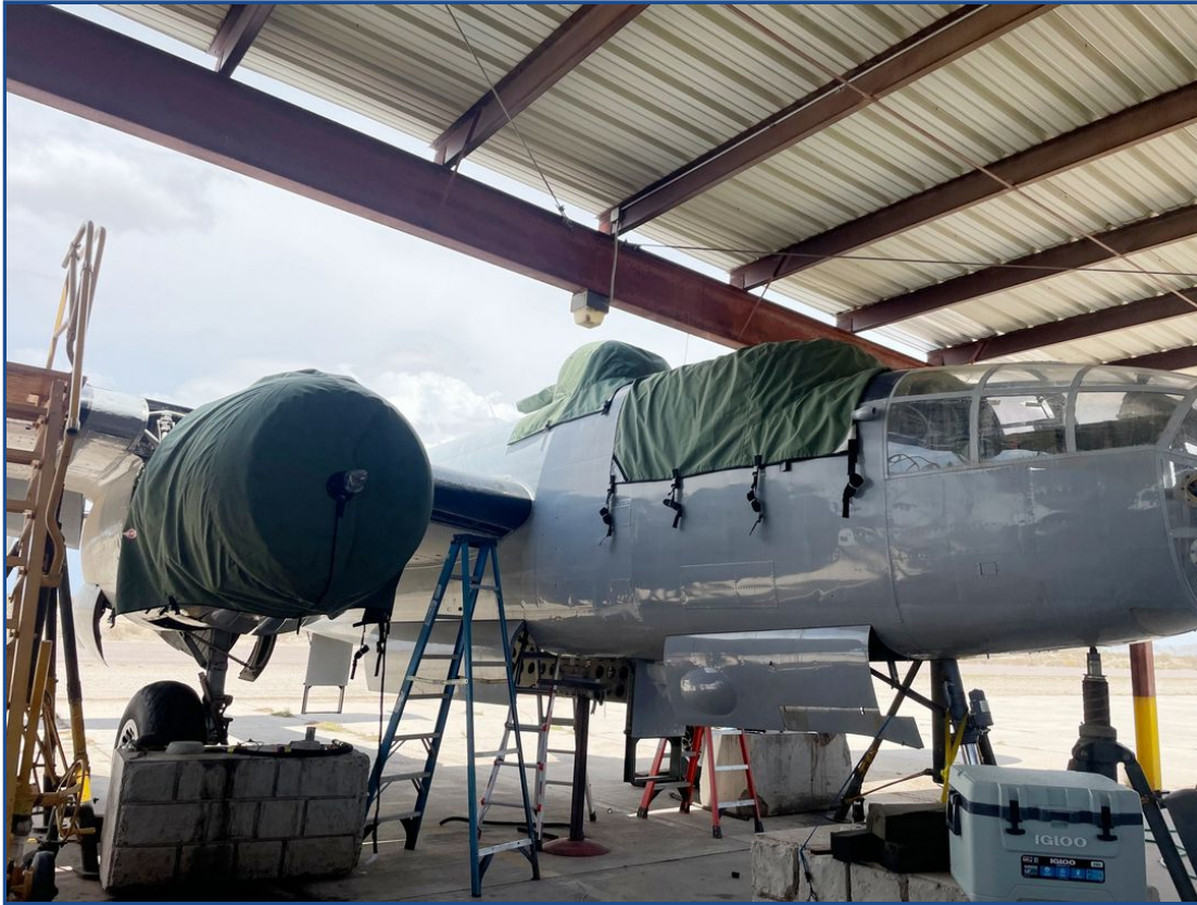
Mitchell B25 Cockpit, Turret &amp; Engine Covers