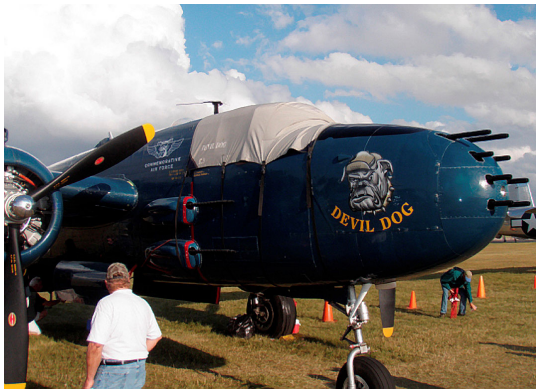
Mitchell B25 Cockpit Cover w/ Custom Imprint (Bellystrap Type)

Engine Inlet Plugs are custom fit for your North American Mitchell B25 intakes, made with heavy-duty vinyl material, and stuffed with a single block of sculpted urethane foam. Each plug has a zipper that allows the foam to be removed and dried if necessary. Engine plugs have warning flags that are visible from the cockpit or 'remove before flight' streamers sewn onto the face of the plugs. Most plugs are imprinted with the aircraft registration number in black for an extra charge. Storage bag NOT included. Engine plugs may be inserted after flight when the engine is still warm. Engine Inlet Plugs are commonly referred to as Cowl Plugs, Intake Plugs, Cowl Blocks, Engine Blocks, and Engine Bung.