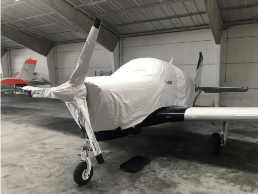
Beech Bonanza A-36 Extended Canopy/Engine Cover, 3-Blade Prop Cover

This cover type is made from Silver Acrylic Sunbrella canvas and is 100% lined with a soft and smooth microfiber. Bruce's Custom Covers developed this material combination especially for aircraft protection. The outer material is medium weight and treated for water resistance, UV resistance and anti-static buildup. The inner lining is a very soft and smooth microfiber to prevent scratching. The material is very reflective, and tests show that the cabin interior temperature can be reduced to near-ambient temperature on the hottest of days. It is water, ice and snow repellent, yet breathable to allow moisture to escape from between the cover and the aircraft surface.