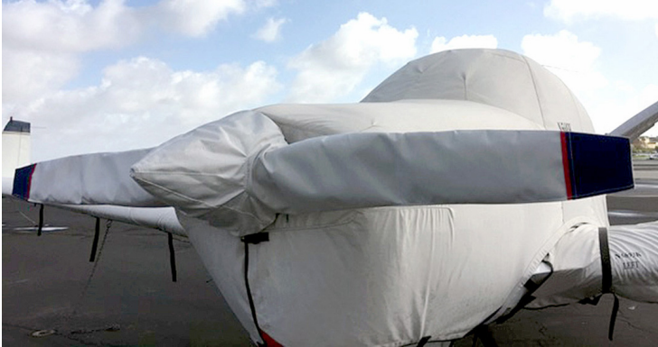
Fully Covered Bonanza S35

This cover type is made from Silver Acrylic Sunbrella canvas and is 100% lined with a soft and smooth microfiber. Bruce's Custom Covers developed this material combination especially for aircraft protection. The outer material is medium weight and treated for water resistance, UV resistance and anti-static buildup. The inner lining is a very soft and smooth microfiber to prevent scratching. The material is very reflective, and tests show that the cabin interior temperature can be reduced to near-ambient temperature on the hottest of days. It is water, ice and snow repellent, yet breathable to allow moisture to escape from between the cover and the aircraft surface.