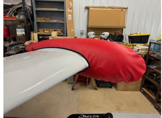
Beech K35 Bonanza Tip Tank Covers