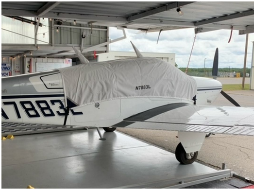
Beech Bonanza V35 Canopy Cover