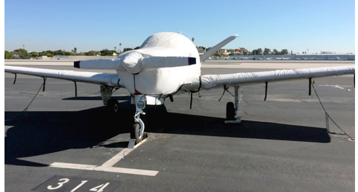
Fully Covered Bonanza S35