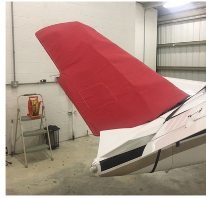
Beech V35B V-Tail Horizontal Stabilizer Cover