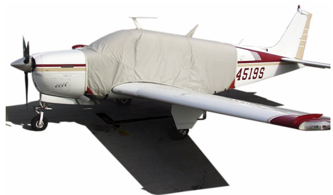
A36 Bonanza Extended Canopy Cover