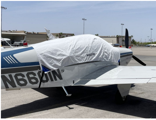
Beech Bonanza Canopy Cover