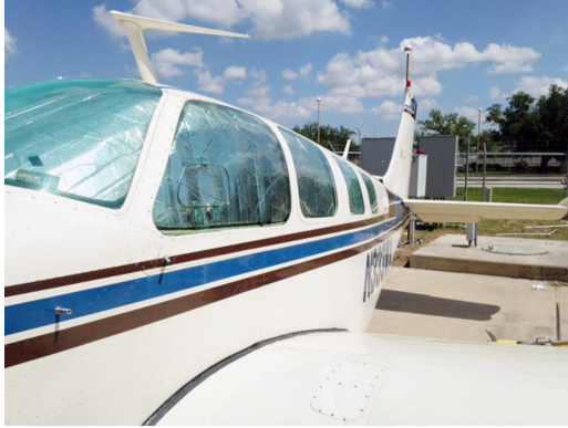
Beech Bonanza HeatShields

Windshield Heatshields are interior sunshades for an aircraft's front windshield. The product is a unique composite of closed-cell foam with a silver mylar finish. The semi-rigid design is stiff enough to stand along the inside of the windshield using sun visors or window framing. It folds up flat and easily stores in the included storage sleeve. Some designs may require velcro and suction cups or split right and left sides. A Heatshield is an excellent short-term remedy for cockpit overheating. An external fabric cover is far more effective and practical for long-term protection.