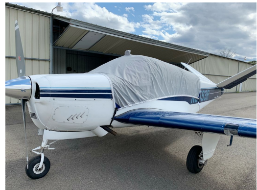
Beech Bonanza Travel Canopy Cover