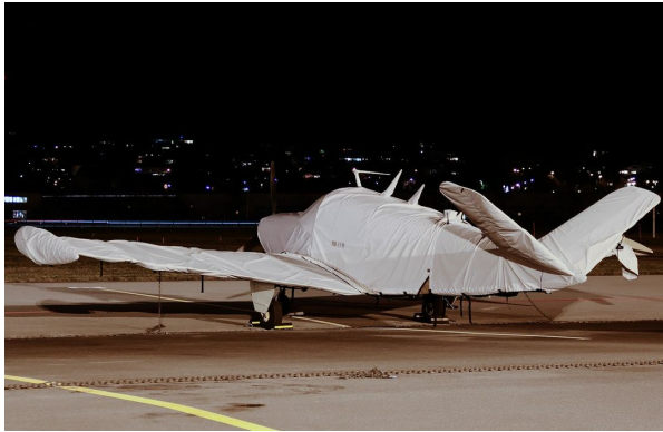
Beech Bonanza Extended Canopy/Engine, Empennage & Wing Covers (with tip tanks)

Designed to prevent damage to the aircraft extremities in crowded hangars, these products are made of bright red Naugahyde and thickly padded with a sandwich of closed cell foam.