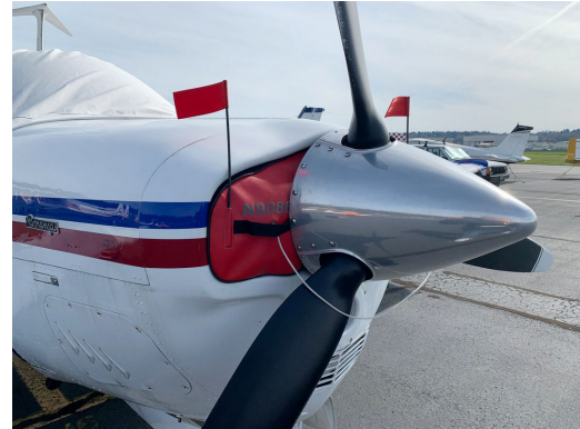
Bonanza/Debonair F33A Engine Inlet Plugs