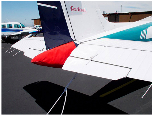
Beech Bonanza Tailcone Cover