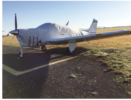
A36 Bonanza Extended Canopy Cover (extends to tail), Fully Enclosed Engine Cover