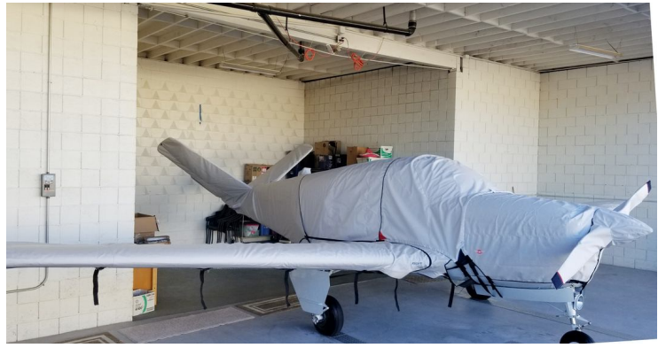
Bonanza N35 Extended Canopy, Engine, Empennage, Wing & Prop Covers