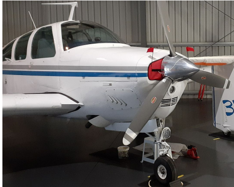
Bonanza V35B Engine Inlet Plugs

Engine Inlet Plugs are custom fit for your Beech Bonanza/Debonair intakes, made with heavy-duty vinyl material, and stuffed with a single block of sculpted urethane foam. Each plug has a zipper that allows the foam to be removed and dried if necessary. Engine plugs have warning flags that are visible from the cockpit or 'remove before flight' streamers sewn onto the face of the plugs. Most plugs are imprinted with the aircraft registration number in black for an extra charge. Storage bag NOT included. Engine plugs may be inserted after flight when the engine is still warm. Engine Inlet Plugs are commonly referred to as Cowl Plugs, Intake Plugs, Cowl Blocks, Engine Blocks, and Engine Bungs. Designed to prevent damage to the aircraft extremities in crowded hangars, these products are made of bright red Naugahyde and thickly padded with a sandwich of closed cell foam.