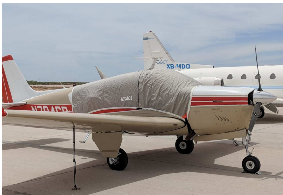
Beech Bonanza F33A Light Weight Travel Cover

Travel Covers are made with Silver Solution-Dyed Polyester fabric and only lined over the windshield to save weight. The material is lightweight and more compact for easy stowage in the aircraft. The polyester material is water resistant, but only intended for occasional use outside. We also have an ultra lightweight material available for fitted hangar dust covers. For daily outdoor use, the non-travel Sunbrella Cover is the best choice.