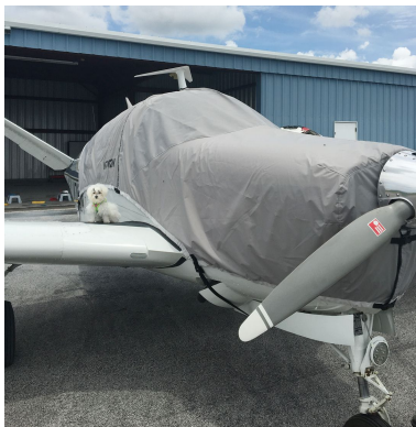
Beech Bonanza V35A Travel Canopy/Engine Cover

Travel Covers are made with Silver Solution-Dyed Polyester fabric and only lined over the windshield to save weight. The material is lightweight and more compact for easy stowage in the aircraft. The polyester material is water resistant, but only intended for occasional use outside. We also have an ultra lightweight material available for fitted hangar dust covers. For daily outdoor use, the non-travel Sunbrella Cover is the best choice.