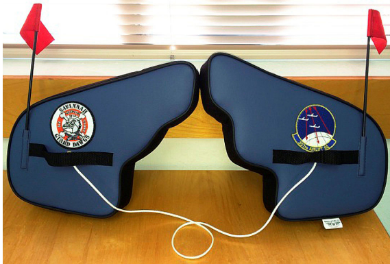
Custom Plug Colors Available, contact us for details!

Engine Inlet Plugs are custom fit for your Beech Bonanza/Debonair intakes, made with heavy-duty vinyl material, and stuffed with a single block of sculpted urethane foam. Each plug has a zipper that allows the foam to be removed and dried if necessary. Engine plugs have warning flags that are visible from the cockpit or 'remove before flight' streamers sewn onto the face of the plugs. Most plugs are imprinted with the aircraft registration number in black for an extra charge. Storage bag NOT included. Engine plugs may be inserted after flight when the engine is still warm. Engine Inlet Plugs are commonly referred to as Cowl Plugs, Intake Plugs, Cowl Blocks, Engine Blocks, and Engine Bungs. Designed to prevent damage to the aircraft extremities in crowded hangars, these products are made of bright red Naugahyde and thickly padded with a sandwich of closed cell foam.