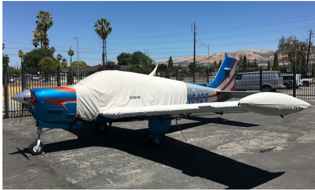
Beech Bonanza A36 Wing Covers with D'Shannon Tip Tanks, Extended Canopy Cover

Designed to prevent damage to the aircraft extremities in crowded hangars, these products are made of bright red Naugahyde and thickly padded with a sandwich of closed cell foam.