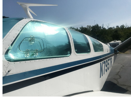
Beechcraft V35A Bonanza Heatshield Set