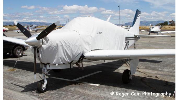
Beech Bonanza Engine and Canopy Cover