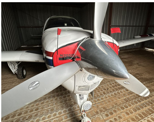
Beech Bonanza A36 Models Engine Inlet Plugs

Engine Inlet Plugs are custom fit for your Beech Bonanza 36 Models intakes, made with heavy-duty vinyl material, and stuffed with a single block of sculpted urethane foam. Each plug has a zipper that allows the foam to be removed and dried if necessary. Engine plugs have warning flags that are visible from the cockpit or 'remove before flight' streamers sewn onto the face of the plugs. Most plugs are imprinted with the aircraft registration number in black for an extra charge. Storage bag NOT included. Engine plugs may be inserted after flight when the engine is still warm. Engine Inlet Plugs are commonly referred to as Cowl Plugs, Intake Plugs, Cowl Blocks, Engine Blocks, and Engine Bungs.