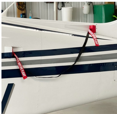
Beechcraft G36 Fresh Air Inlet/Exhaust Plugs