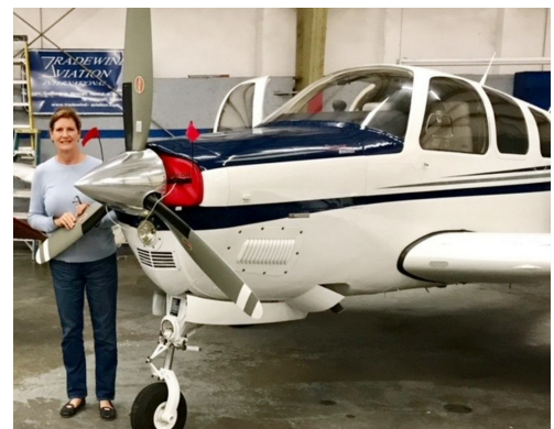
Beech A36 Engine Plugs