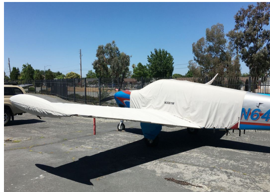
Beech Bonanza A36 Extended Canopy, Wing Covers with D'Shannon Tip Tanks