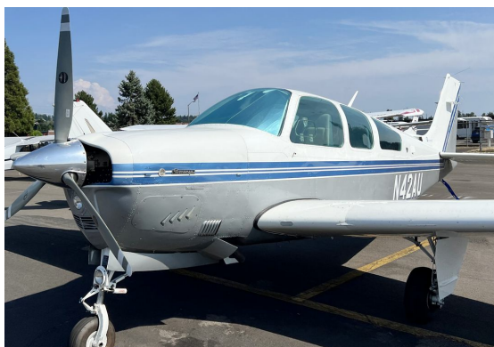
Beech Bonanza F33A Windshield HeatShield

Windshield Heatshields are interior sunshades for an aircraft's front windshield. The product is a unique composite of closed-cell foam with a silver mylar finish. The semi-rigid design is stiff enough to stand along the inside of the windshield using sun visors or window framing. It folds up flat and easily stores in the included storage sleeve. Some designs may require velcro and suction cups or split right and left sides. A Heatshield is an excellent short-term remedy for cockpit overheating. An external fabric cover is far more effective and practical for long-term protection.