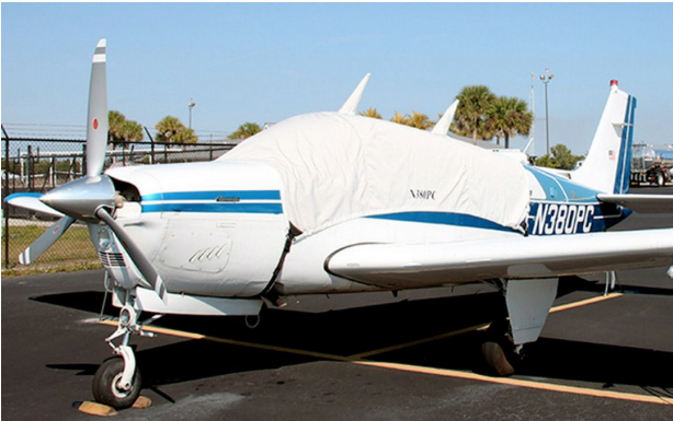
Beech A36 Bonanza Canopy Cover

This cover type is made from Silver Acrylic Sunbrella canvas and is 100% lined with a soft and smooth microfiber. Bruce's Custom Covers developed this material combination especially for aircraft protection. The outer material is medium weight and treated for water resistance, UV resistance and anti-static buildup. The inner lining is a very soft and smooth microfiber to prevent scratching. The material is very reflective, and tests show that the cabin interior temperature can be reduced to near-ambient temperature on the hottest of days. It is water, ice and snow repellent, yet breathable to allow moisture to escape from between the cover and the aircraft surface.