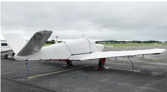
Beech Bonanza/Debonair Empennage Cover (Tailboom & Stabilators) (V-Tail Models), All Year Use

WINTER USE MATERIAL - Made with Solution-Dyed Polyester fabric, this option is intended for seasonal use to aid in deicing, rain mitigation, or for occasional travel. The material is lighter and more compact, but more susceptible to UV damage and may have a shorter useful life if used continuously outside than the all-year use material.