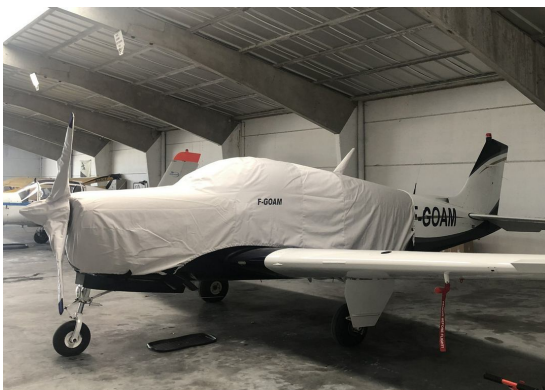
Beech Bonanza A-36 Extended Canopy/Engine Cover, 3-Blade Prop Cover

This cover type is made from Silver Acrylic Sunbrella canvas and is 100% lined with a soft and smooth microfiber. Bruce's Custom Covers developed this material combination especially for aircraft protection. The outer material is medium weight and treated for water resistance, UV resistance and anti-static buildup. The inner lining is a very soft and smooth microfiber to prevent scratching. The material is very reflective, and tests show that the cabin interior temperature can be reduced to near-ambient temperature on the hottest of days. It is water, ice and snow repellent, yet breathable to allow moisture to escape from between the cover and the aircraft surface.