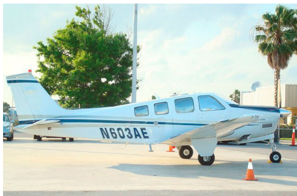
Bonanza A36 HeatShield Set

Windshield Heatshields are interior sunshades for an aircraft's front windshield. The product is a unique composite of closed-cell foam with a silver mylar finish. The semi-rigid design is stiff enough to stand along the inside of the windshield using sun visors or window framing. It folds up flat and easily stores in the included storage sleeve. Some designs may require velcro and suction cups or split right and left sides. A Heatshield is an excellent short-term remedy for cockpit overheating. An external fabric cover is far more effective and practical for long-term protection.