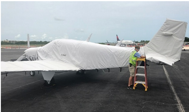
Bonanza G36 Full Cover Set

This cover type is made from Silver Acrylic Sunbrella canvas and is 100% lined with a soft and smooth microfiber. Bruce's Custom Covers developed this material combination especially for aircraft protection. The outer material is medium weight and treated for water resistance, UV resistance and anti-static buildup. The inner lining is a very soft and smooth microfiber to prevent scratching. The material is very reflective, and tests show that the cabin interior temperature can be reduced to near-ambient temperature on the hottest of days. It is water, ice and snow repellent, yet breathable to allow moisture to escape from between the cover and the aircraft surface.