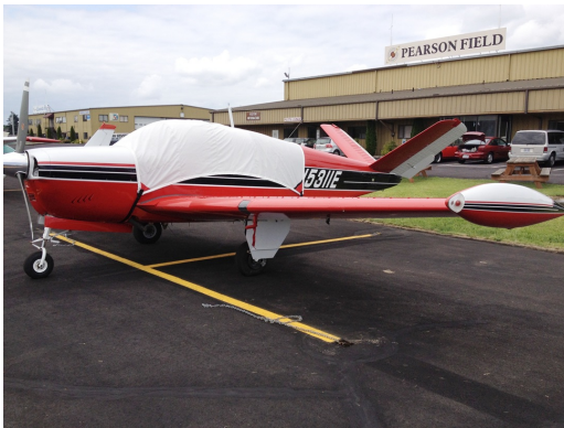
Beech Bonanza Canopy Cover

This cover type is made from Silver Acrylic Sunbrella canvas and is 100% lined with a soft and smooth microfiber. Bruce's Custom Covers developed this material combination especially for aircraft protection. The outer material is medium weight and treated for water resistance, UV resistance and anti-static buildup. The inner lining is a very soft and smooth microfiber to prevent scratching. The material is very reflective, and tests show that the cabin interior temperature can be reduced to near-ambient temperature on the hottest of days. It is water, ice and snow repellent, yet breathable to allow moisture to escape from between the cover and the aircraft surface.