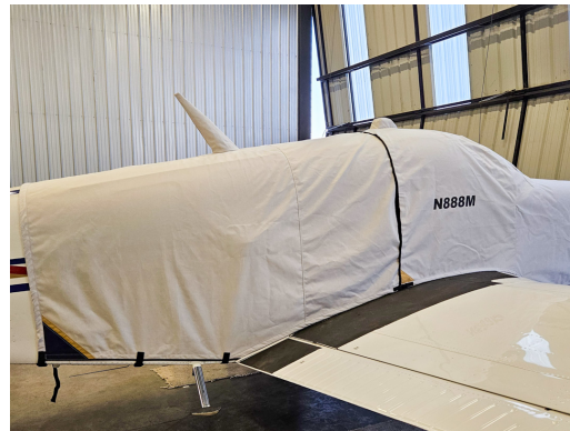
Beech Bonanza 36 Models Extended Canopy/Engine Cover, Belly Strap Type