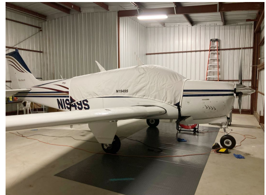
Beech A36 Bonanza Canopy Cover