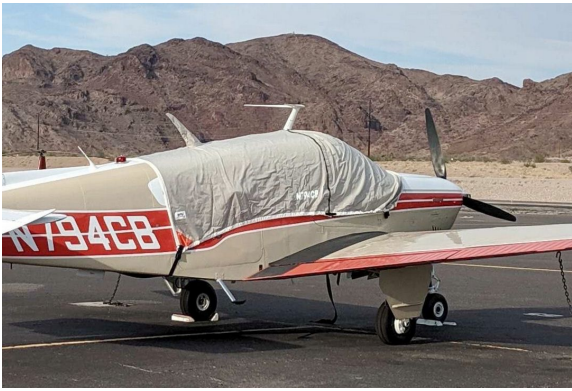
Beech Bonanza F33A Light Weight Travel Cover