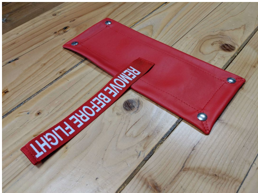
Bonanza 36 Induction Air Filter Cover

Cowl Blocks, Engine Blocks, and Engine Bungs. Designed to prevent damage to the aircraft extremities in crowded hangars, these products are made of bright red Naugahyde and thickly padded with a sandwich of closed cell foam.