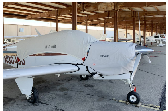
Beech Bonanza Engine Cover, Canopy Cover