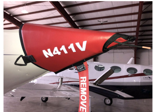
Cessna 335, 340 Wingtip Pads