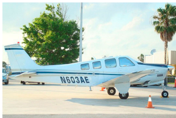
Bonanza A36 HeatShield Set