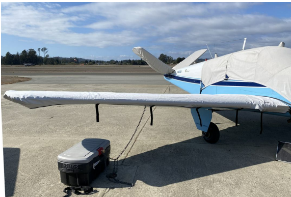
BEECH J35 WING COVERS

WINTER USE MATERIAL - Made with Solution-Dyed Polyester fabric, this option is intended for seasonal use to aid in deicing, rain mitigation, or for occasional travel. The material is lighter and more compact, but more susceptible to UV damage and may have a shorter useful life if used continuously outside than the all-year use material.