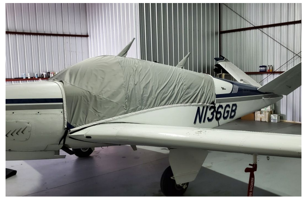
Beech Bonanza Travel Weight Canopy Cover