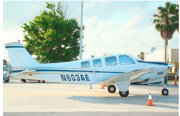
Beech Bonanza Heatshield Set