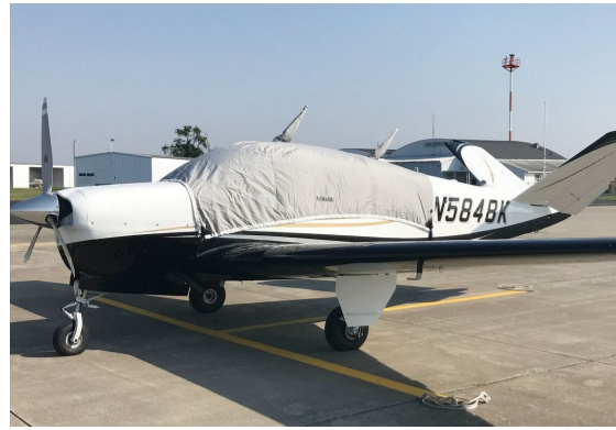
Beech Bonanza/Debonair Travel Cover, Light Weight Travel Canopy Cover