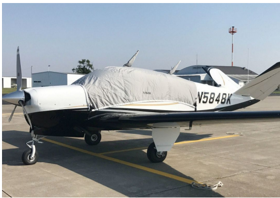
Beech Bonanza/Debonair Travel Cover, Light Weight Travel Canopy Cover