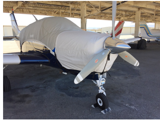
Beech Bonanza Standard Engine Cover, not fully enclosed