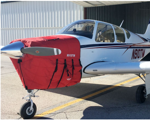
Beech Debonair Insulated Engine Cover