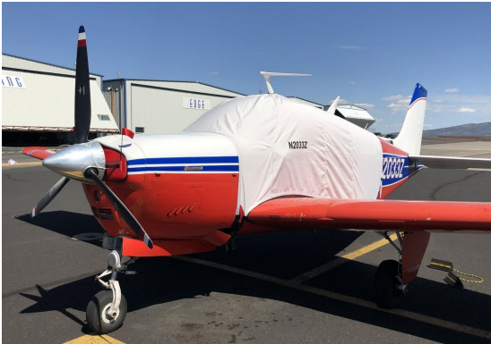
Beech Bonanza F33A Extended Canopy Cover, Engine Plugs