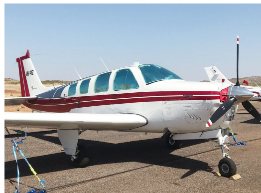
Beech A-36 Bonanza Cabin HeatShields