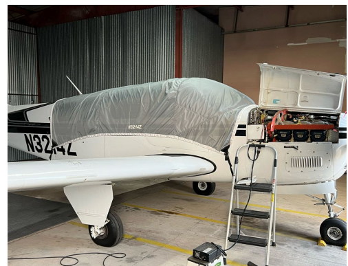
Beech A36 Light Weight Travel Canopy Cover