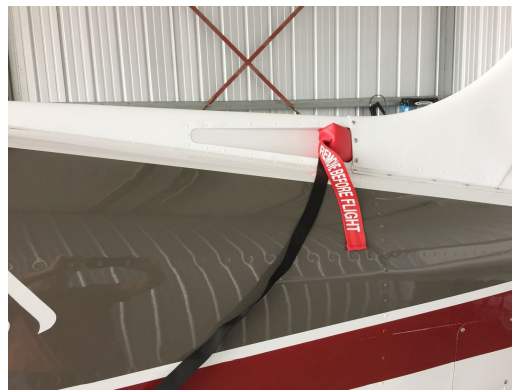
Beech Bonanza/Baron Fresh Air Intake & Exhaust Plugs