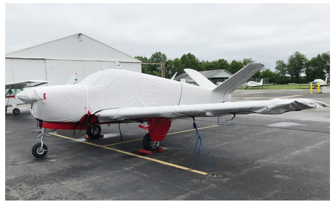
Beech Bonanza A-36 Extended Canopy/Engine Cover, 3- Blade Prop Cover Beech Bonanza/Debonair Extended Canopy Cover (Specify Lg Or Sm Windshield & Lg Or Sm 3rd Window)