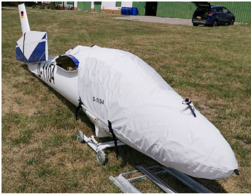
Pilatus B-4 Canopy/Nose Cover