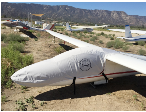
Pilatus B4 Canopy/Nose Cover