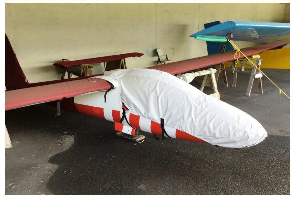
Pilatus B4 Canopy/Nose Cover