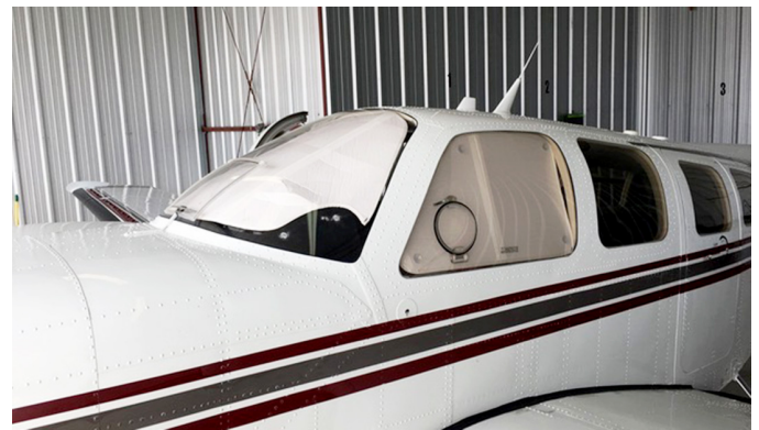
Beech Baron 58P Cockpit Heatshield Set