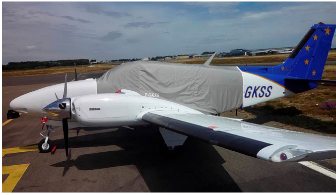
Baron Extended Canopy Cover, Pitot Cover and Cowl Top Plugs