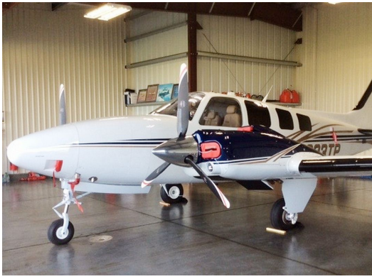
Beech Baron 58 Engine Inlet Plugs, Cowl Top Plugs, Heater Inlet, Pitot Cover