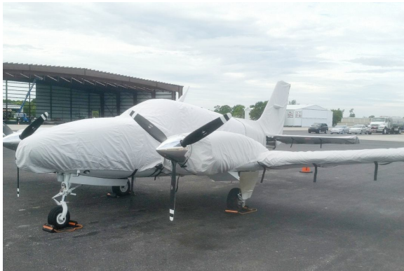
Full Cover Set (58P-020, 58P-225, 58P-405)

WINTER USE MATERIAL - Made with Solution-Dyed Polyester fabric, this option is intended for seasonal use to aid in deicing, rain mitigation, or for occasional travel. The material is lighter and more compact, but more susceptible to UV damage and may have a shorter useful life if used continuously outside than the all-year use material.