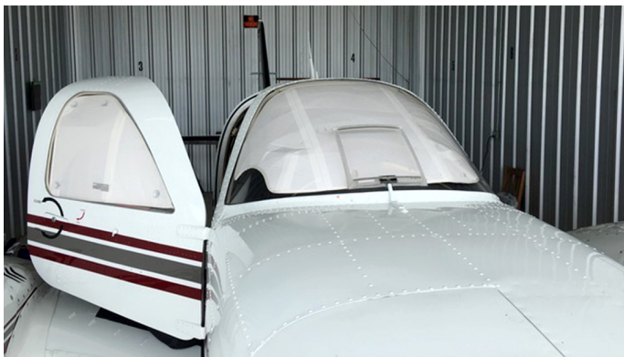
Beech Baron 58P Cockpit Heatshield Set

Windshield Heatshields are interior sunshades for an aircraft's front windshield. The product is a unique composite of closed-cell foam with a silver mylar finish. The semi-rigid design is stiff enough to stand along the inside of the windshield using sun visors or window framing. It folds up flat and easily stores in the included storage sleeve. Some designs may require velcro and suction cups or split right and left sides. A Heatshield is an excellent short-term remedy for cockpit overheating. An external fabric cover is far more effective and practical for long-term protection.