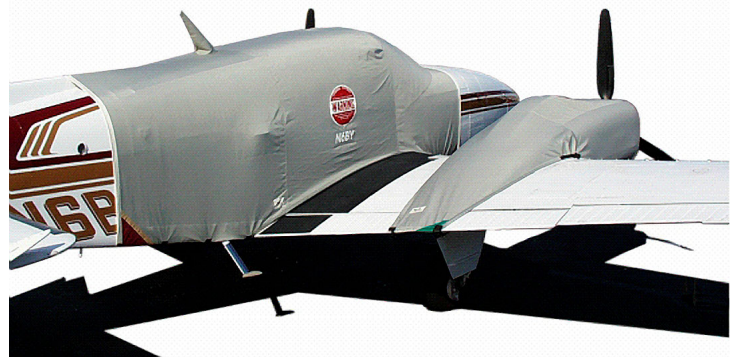
Baron Extended Canopy Cover & Engine Covers