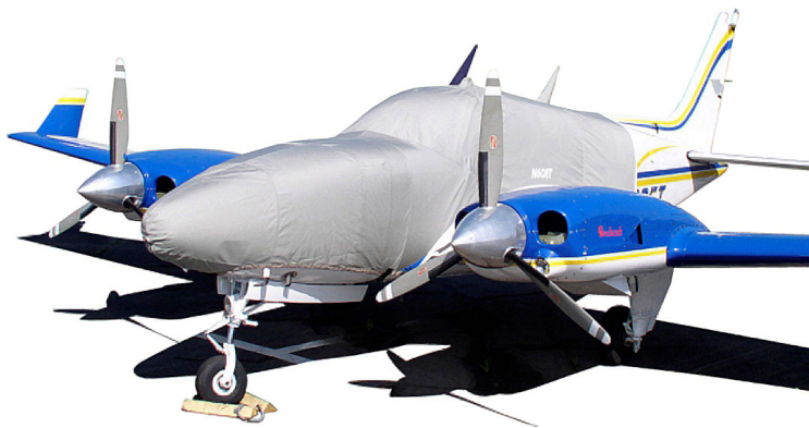
Baron Canopy/Nose Cover

Travel Covers are made with Silver Solution-Dyed Polyester fabric and only lined over the windshield to save weight. The material is lightweight and more compact for easy stowage in the aircraft. The polyester material is water resistant, but only intended for occasional use outside. We also have an ultra lightweight material available for fitted hangar dust covers. For daily outdoor use, the non-travel Sunbrella Cover is the best choice.