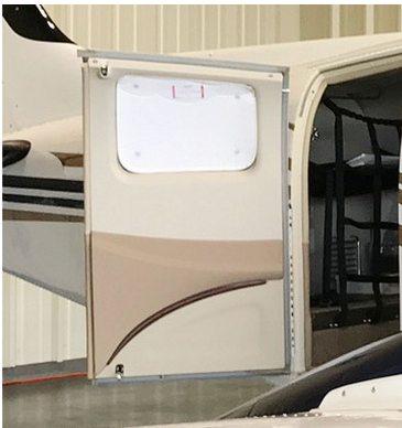
Beech Baron 58 Cabin HeatShield

Windshield Heatshields are interior sunshades for an aircraft's front windshield. The product is a unique composite of closed-cell foam with a silver mylar finish. The semi-rigid design is stiff enough to stand along the inside of the windshield using sun visors or window framing. It folds up flat and easily stores in the included storage sleeve. Some designs may require velcro and suction cups or split right and left sides. A Heatshield is an excellent short-term remedy for cockpit overheating. An external fabric cover is far more effective and practical for long-term protection.