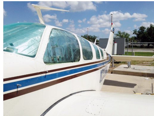
Beech Bonanza Heatshield Set