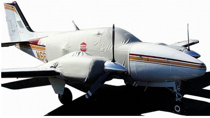
Standard Canopy Cover & Engine Plugs. Extended Canopy Cover & Engine Cover