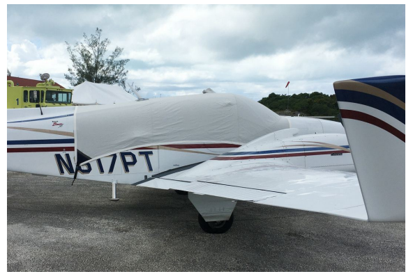
Beech Baron 58 Canopy Cover