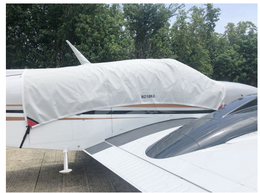
Baron G58 Travel Cover