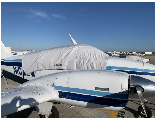
Beech Baron Canopy Cover