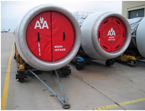
MD-80 JT8D Intake Plugs, Solid Foam folding type& Mesh Center folding type