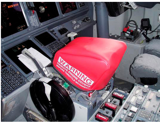
Boeing Throttle Quadrant Cover

ALL-YEAR USE MATERIAL - Made with Silver Acrylic Sunbrella canvas, the all-year use material is the best option for sun protection and cover longevity. This heavier more durable material is intended for all weather conditions, such as rain and snow or lots of sun.