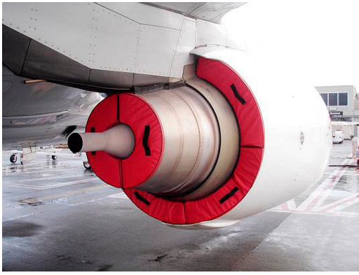
Boeing 737 Bypass and Exhaust Plugs