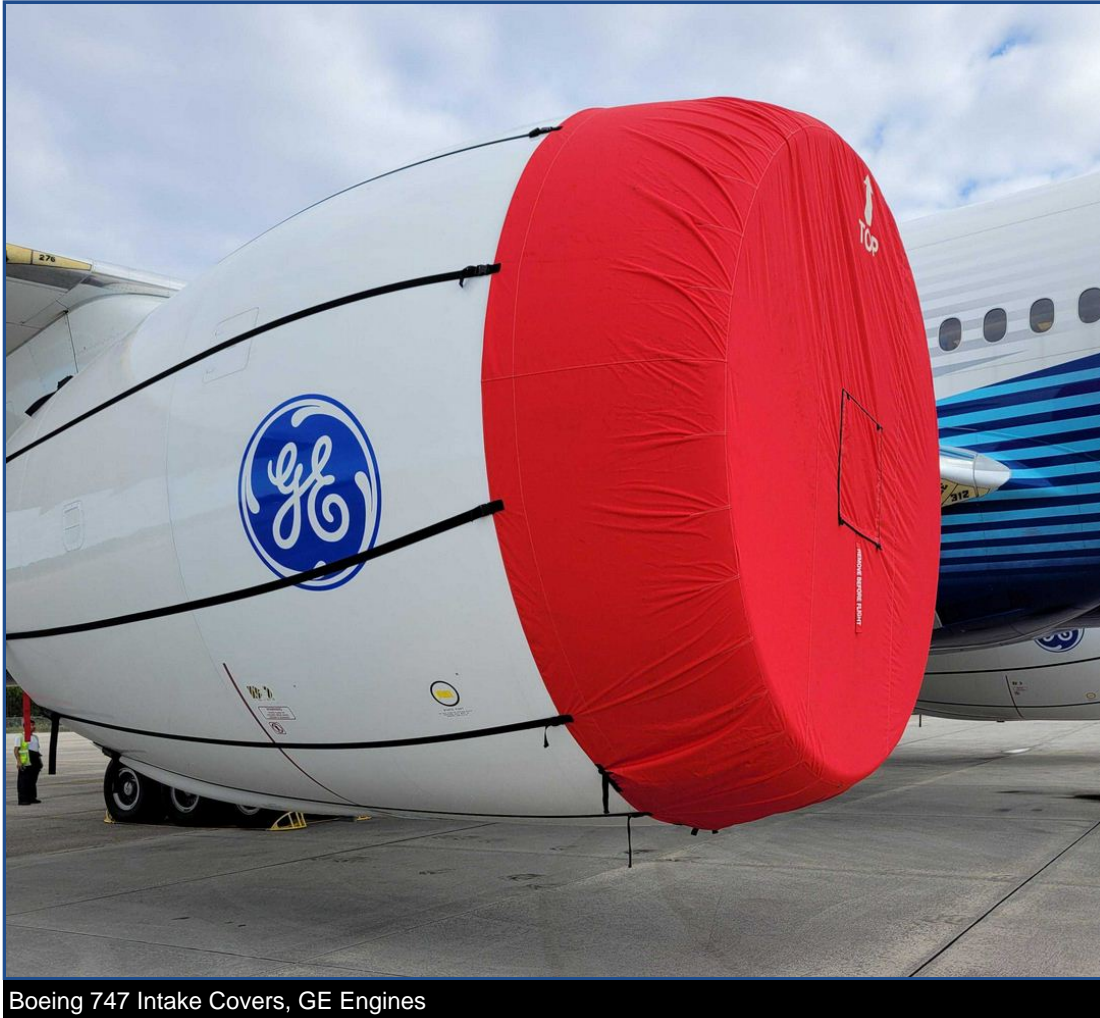
Boeing 747 Intake Covers, GE Engines