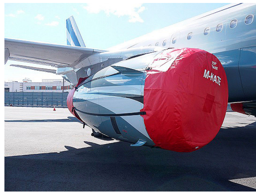
Airbus A319 Intake/Exhaust Covers set, IAE V2500