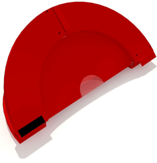
Airbus A330 Intake Plug, framed bi-fold type