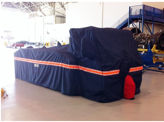
Complete Cover for Eagle Tug