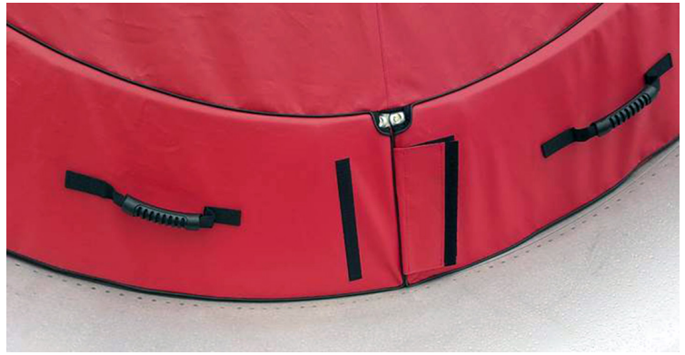
Boeing 747 Intake Plugs, Genx Engines, Framed Bi-Fold Type