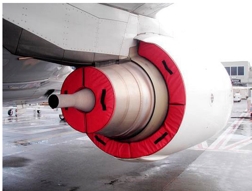
Boeing 737 Bypass and Exhaust Plugs