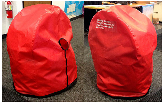
Boeing 757 Tire Covers, great for Wash Prep or Storage