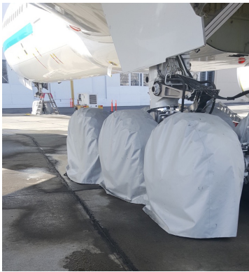
Boeing 777 Main & Nose Gear Tire Covers

ALL-YEAR USE MATERIAL - Made with Silver Acrylic Sunbrella canvas, the all-year use material is the best option for sun protection and cover longevity. This heavier more durable material is intended for all weather conditions, such as rain and snow or lots of sun.