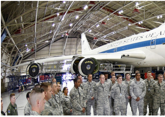
BOEING E-4B INTAKE COVERS