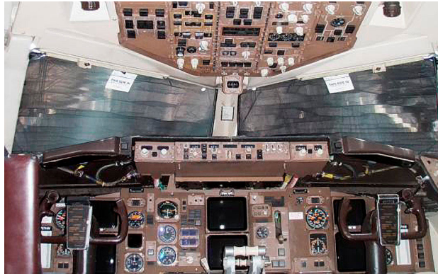
Boeing Cockpit HeatShield set

Heatshield is an excellent short-term remedy for cockpit overheating, but an external fabric cover is more effective for long-term protection.