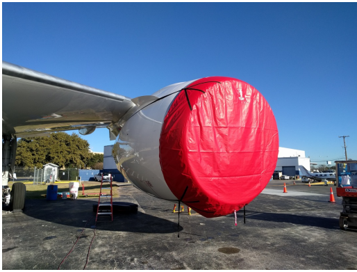
Boeing 787 Intake Cover