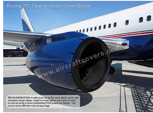
Boeing 757 RB.211 Intake Covers, using existing pit pin locations