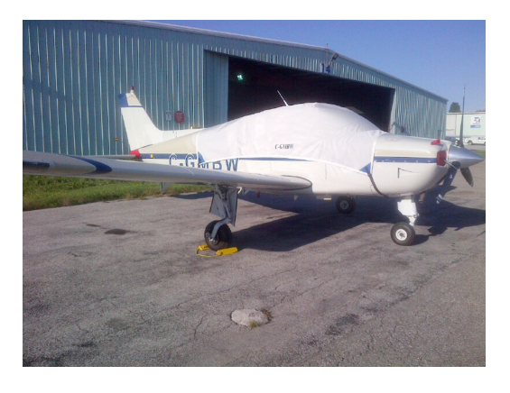
Beech Sierra Canopy Cover, Engine Plugs, Tailcone Cover