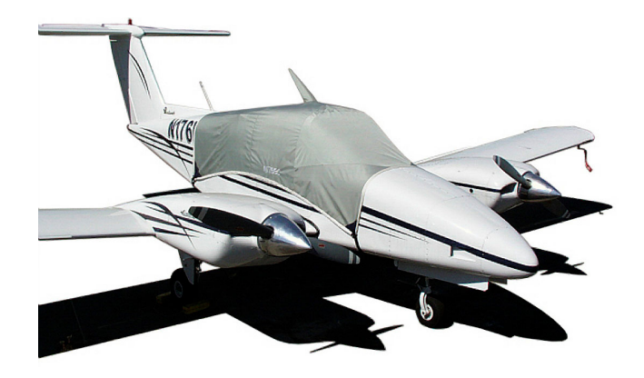
Duchess Standard Canopy Cover

This cover type is made from Silver Acrylic Sunbrella canvas and is 100% lined with a soft and smooth microfiber. Bruce's Custom Covers developed this material combination especially for aircraft protection. The outer material is medium weight and treated for water resistance, UV resistance and anti-static buildup. The inner lining is a very soft and smooth microfiber to prevent scratching. The material is very reflective, and tests show that the cabin interior temperature can be reduced to near-ambient temperature on the hottest of days. It is water, ice and snow repellent, yet breathable to allow moisture to escape from between the cover and the aircraft surface.