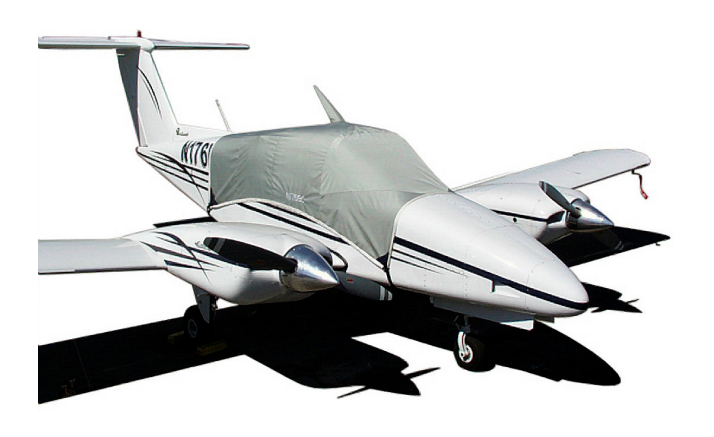
Duchess Standard Canopy Cover