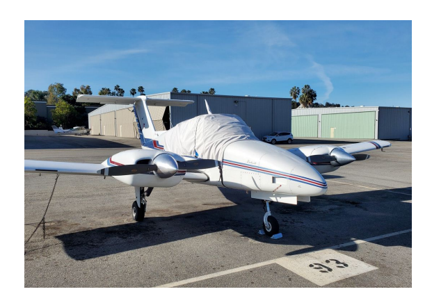
Beech Duchess Canopy Cover