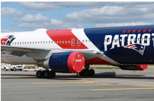
Boeing 767 Intake Covers

FABRIC & THREAD: For strength, durability and ease of use we make these covers of the heaviest nylon ballistic cloth. It is sewn in multiple courses with Tenara thread, and reinforced with heavy vinyl cloth at high-wear points.