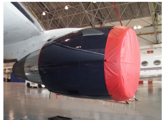
Boeing 767 Intake Covers Ship Set