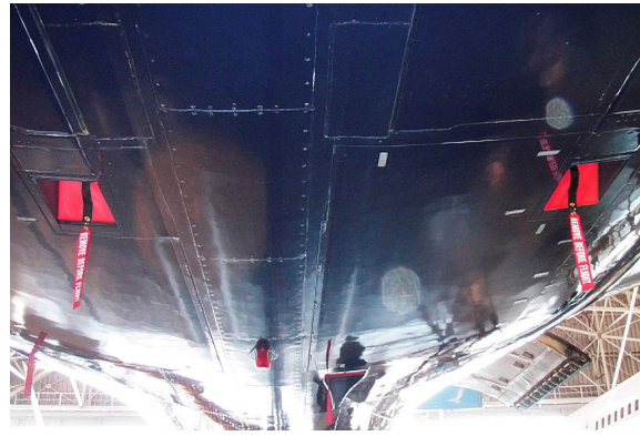
Boeing 767 Passenger A/C Inlet/Exhaust Plug Set of 4, P/N: B767-205