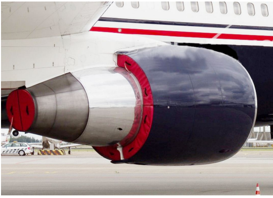
Boeing 767 Bypass and Exhaust Plugs