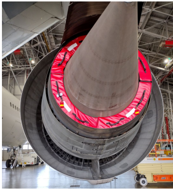
Boeing 777 Bypass Vent & Turbine Exhaust Plugs, Ge90 Engines