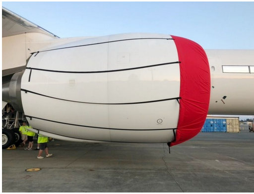
Boeing 777 Intake Covers, GE9X Engine