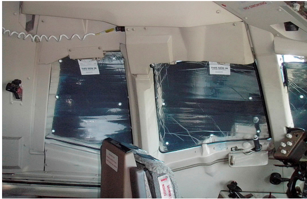
Boeing 767 Cockpit HeatShield set

Cockpit Heatshields are interior sunshades for the aircraft's cockpit. The product is a unique composite of closed-cell foam with a silver mylar finish. The semi-rigid design is stiff enough to stand inside the window framing. The set folds up flat and is easily stored in the included storage sleeve. Some designs may require velcro and suction cups. Our Heatshields for jets are offered white side out because some aircraft manufacturers have issued advisories against reflective window inserts due to potential heat damage. A Heatshield is an excellent short-term remedy for cockpit overheating, but an external fabric cover is more effective for long-term protection.