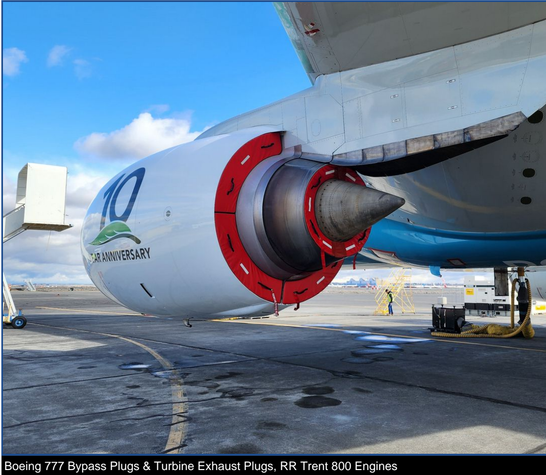
Boeing 777 Bypass Plugs & Turbine Exhaust Plugs, RR Trent 800 Engines