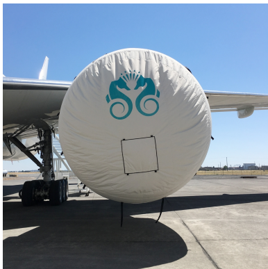
Boeing 777 Intake Covers, GE Engine