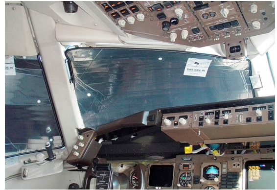
Boeing 767 Cockpit HeatShield set