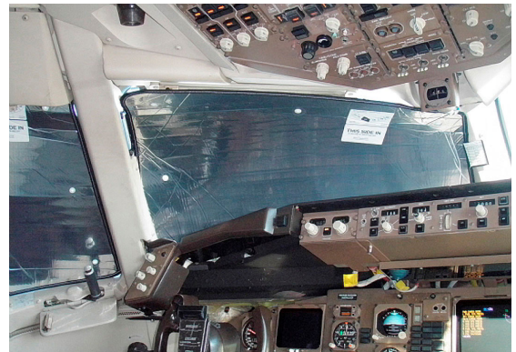
Boeing 767 Cockpit HeatShield set