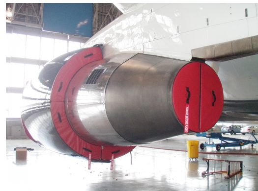
Exhaust Plugs Ship Set, incl. Fan Thrust Reverser and Exhaust Plugs P/N: B767-200