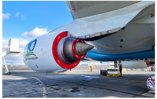
Boeing 777 Bypass Vent & Exhaust Plugs