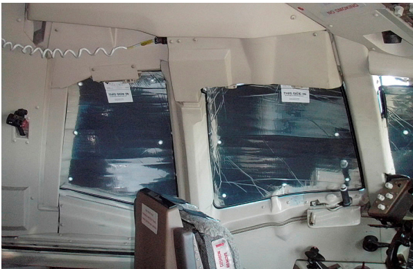
Boeing 767 Cockpit HeatShield set

Cockpit Heatshields are interior sunshades for the aircraft's cockpit. The product is a unique composite of closed-cell foam with a silver mylar finish. The semi-rigid design is stiff enough to stand inside the window framing. The set folds up flat and is easily stored in the included storage sleeve. Some designs may require velcro and suction cups. Our Heatshields for jets are offered white side out because some aircraft manufacturers have issued advisories against reflective window inserts due to potential heat damage. A Heatshield is an excellent short-term remedy for cockpit overheating, but an external fabric cover is more effective for long-term protection.