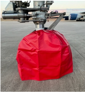
Boeing 777 Nose Gear Tire Covers