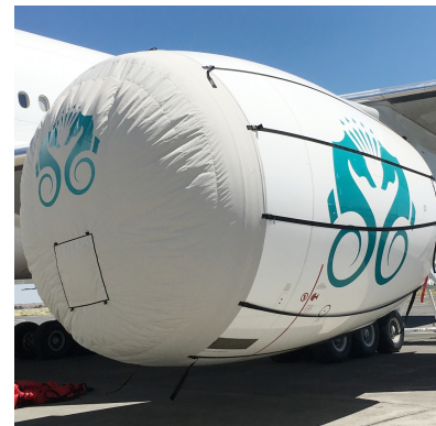
Boeing 777 Intake Covers, GE Engine