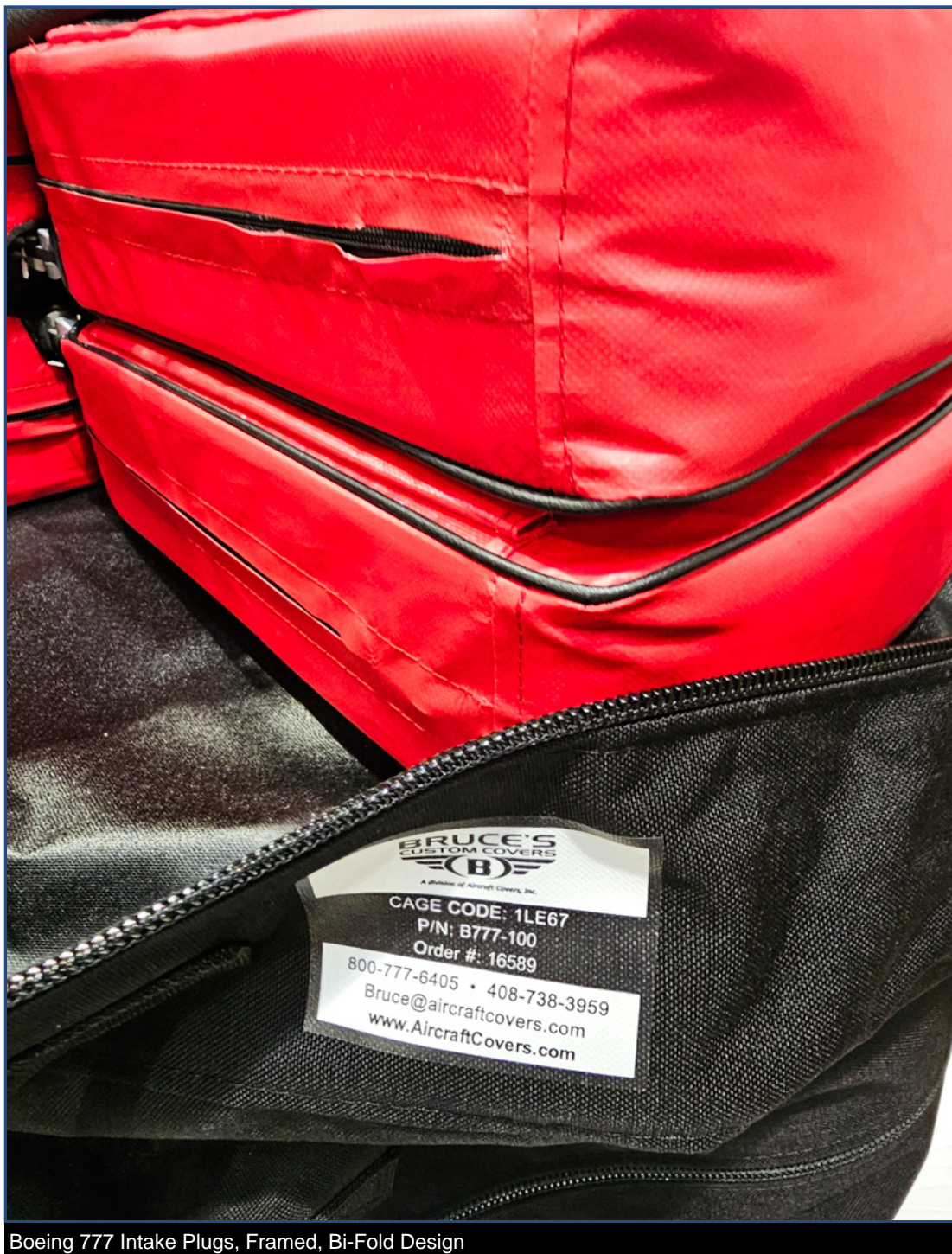
Boeing 777 Intake Plugs, Framed, Bi-Fold Design