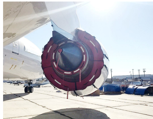
Boeing 787 Dreamliner Bypass Vent, Turbine Exhaust, & Exhaust Nozzle Plugs, Genx Engines