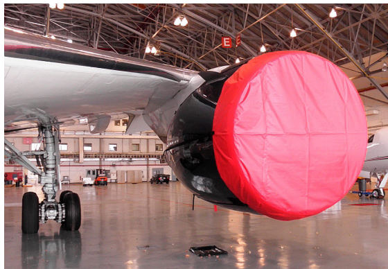
Boeing 767 Intake Covers, P/N: B767-105