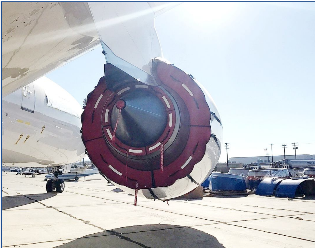
Boeing 787 Dreamliner Bypass Vent, Turbine Exhaust, & Exhaust Nozzle Plugs, Genx Engines