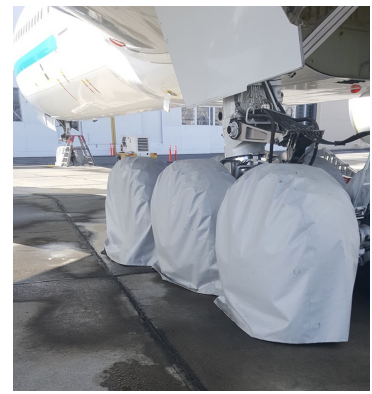
Boeing 777 Main & Nose Gear Tire Covers