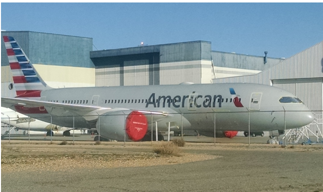
Boeing 787 Intake Covers