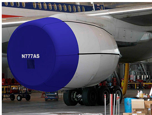
Boeing 777 Intake Cover, GE Engine