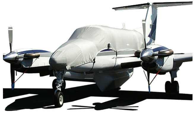
King Air Canopy/Nose Cover