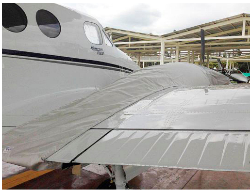
King Air C90 Engine Cover