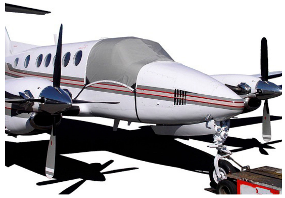
King Air 200/300 Snap-On Windshield Cover