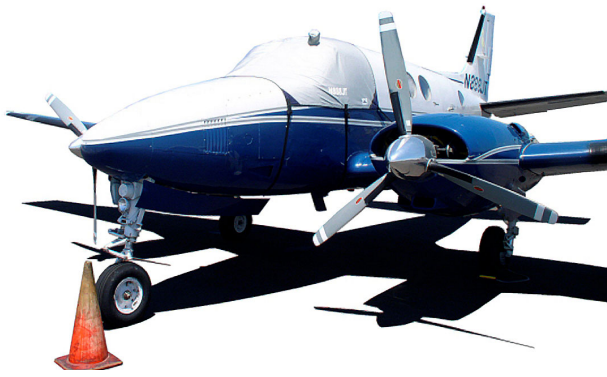
Beech King Air Windshield Cover