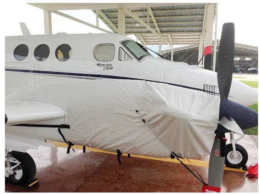
King Air C90 Engine Cover