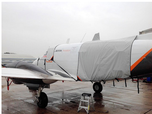
King Air Cargo/Jump Door Rain Cover