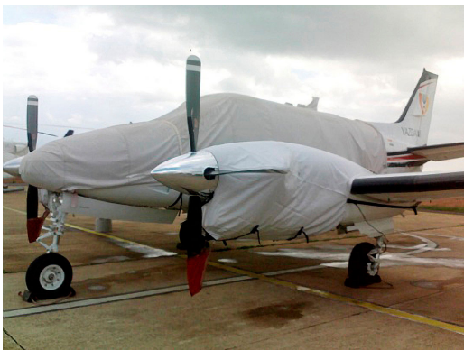
King Air C90 Canopy/Nose Cover, Engine Covers

This cover type is made from Silver Acrylic Sunbrella canvas and is 100% lined with a soft and smooth microfiber. Bruce's Custom Covers developed this material combination especially for aircraft protection. The outer material is medium weight and treated for water resistance, UV resistance and anti-static buildup. The inner lining is a very soft and smooth microfiber to prevent scratching. The material is very reflective, and tests show that the cabin interior temperature can be reduced to near-ambient temperature on the hottest of days. It is water, ice and snow repellent, yet breathable to allow moisture to escape from between the cover and the aircraft surface.