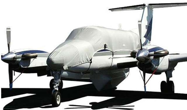
King Air Canopy/Nose Cover

This cover type is made from Silver Acrylic Sunbrella canvas and is 100% lined with a soft and smooth microfiber. Bruce's Custom Covers developed this material combination especially for aircraft protection. The outer material is medium weight and treated for water resistance, UV resistance and anti-static buildup. The inner lining is a very soft and smooth microfiber to prevent scratching. The material is very reflective, and tests show that the cabin interior temperature can be reduced to near-ambient temperature on the hottest of days. It is water, ice and snow repellent, yet breathable to allow moisture to escape from between the cover and the aircraft surface.