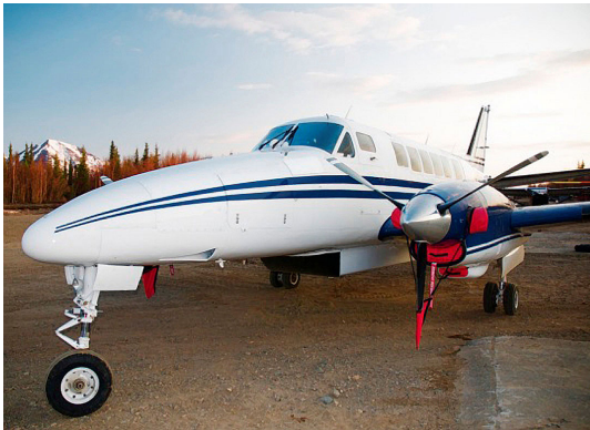
Beech 99 Engine Plugs & Prop Ties

Engine Inlet Plugs are custom fit for your Beech 99 Airliner intakes, made with heavy-duty vinyl material, and stuffed with a single block of sculpted urethane foam. Each plug has a zipper that allows the foam to be removed and dried if necessary. Engine plugs have warning flags that are visible from the cockpit or 'remove before flight' streamers sewn onto the face of the plugs. Most plugs are imprinted with the aircraft registration number in black for an extra charge. Storage bag NOT included. Engine plugs may be inserted after flight when the engine is still warm. Engine Inlet Plugs are commonly referred to as Cowl Plugs, Intake Plugs, Cowl Blocks, Engine Blocks, and Engine Bungs.