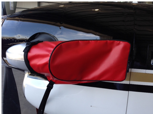
King Air Exhaust Stack Cover

This cover type is made from Silver Acrylic Sunbrella canvas and is 100% lined with a soft and smooth microfiber. Bruce's Custom Covers developed this material combination especially for aircraft protection. The outer material is medium weight and treated for water resistance, UV resistance and anti-static buildup. The inner lining is a very soft and smooth microfiber to prevent scratching. The material is very reflective, and tests show that the cabin interior temperature can be reduced to near-ambient temperature on the hottest of days. It is water, ice and snow repellent, yet breathable to allow moisture to escape from between the cover and the aircraft surface.