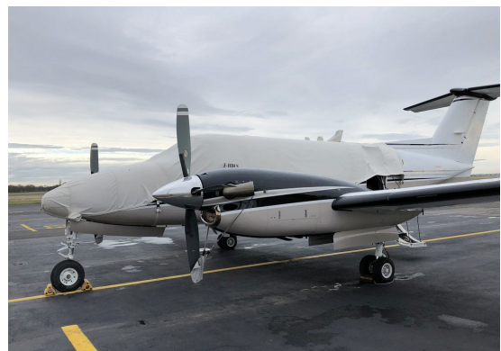
King Air 200 Canopy/Nose Cover