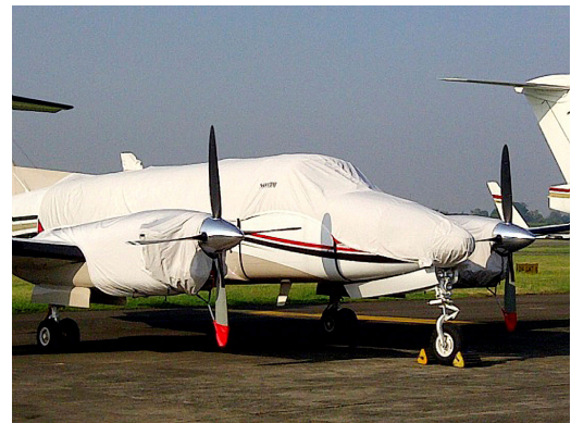
King Air 350 Canopy/Nose Cover, Engine Covers