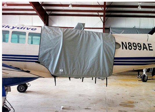
750XL Jump Door Cover