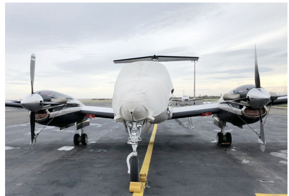
King Air 200 Canopy/Nose Cover