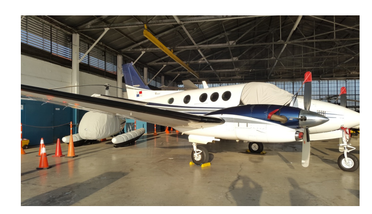
British Aerospace Jetstream 31 Cockpit Cover