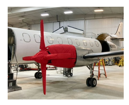
Fairchild Merlin Insulated Engine & Prop Covers

This cover type is made from Silver Acrylic Sunbrella canvas and is 100% lined with a soft and smooth microfiber. Bruce's Custom Covers developed this material combination especially for aircraft protection. The outer material is medium weight and treated for water resistance, UV resistance and anti-static buildup. The inner lining is a very soft and smooth microfiber to prevent scratching. The material is very reflective, and tests show that the cabin interior temperature can be reduced to near-ambient temperature on the hottest of days. It is water, ice and snow repellent, yet breathable to allow moisture to escape from between the cover and the aircraft surface.