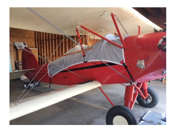
Bird BK Travel Canopy Cover

Travel Covers are made with Silver Solution-Dyed Polyester fabric and only lined over the windshield to save weight. The material is lightweight and more compact for easy stowage in the aircraft. The polyester material is water resistant, but only intended for occasional use outside. We also have an ultra lightweight material available for fitted hangar dust covers. For daily outdoor use, the non-travel Sunbrella Cover is the best choice.