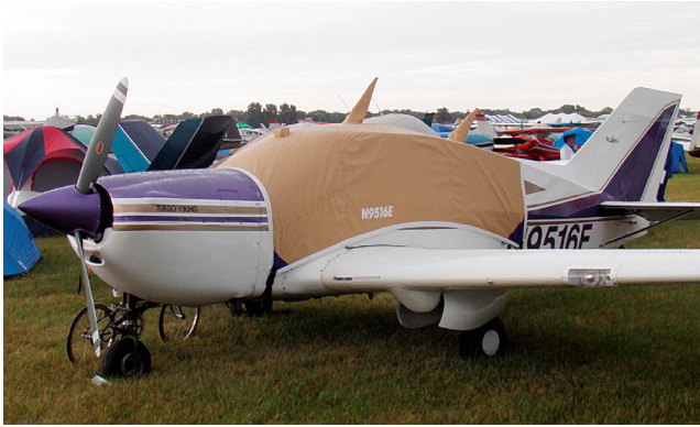
Bellanca Viking Canopy Cover

This cover type is made from Silver Acrylic Sunbrella canvas and is 100% lined with a soft and smooth microfiber. Bruce's Custom Covers developed this material combination especially for aircraft protection. The outer material is medium weight and treated for water resistance, UV resistance and anti-static buildup. The inner lining is a very soft and smooth microfiber to prevent scratching. The material is very reflective, and tests show that the cabin interior temperature can be reduced to near-ambient temperature on the hottest of days. It is water, ice and snow repellent, yet breathable to allow moisture to escape from between the cover and the aircraft surface.