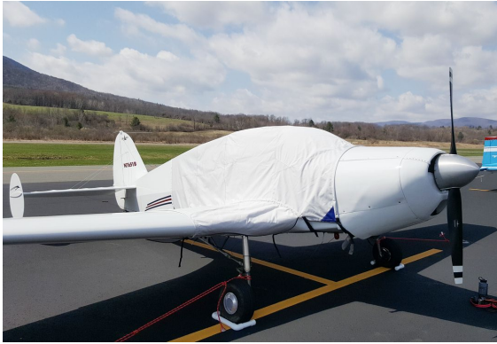
Bellanca Cruisemaster Extended Canopy Cover with 36" Wing Extensions.

This cover type is made from Silver Acrylic Sunbrella canvas and is 100% lined with a soft and smooth microfiber. Bruce's Custom Covers developed this material combination especially for aircraft protection. The outer material is medium weight and treated for water resistance, UV resistance and anti-static buildup. The inner lining is a very soft and smooth microfiber to prevent scratching. The material is very reflective, and tests show that the cabin interior temperature can be reduced to near-ambient temperature on the hottest of days. It is water, ice and snow repellent, yet breathable to allow moisture to escape from between the cover and the aircraft surface.