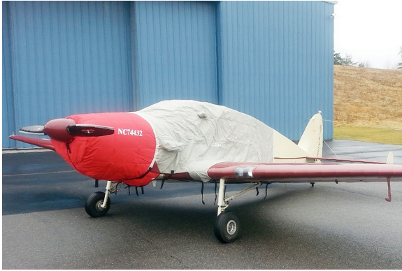
Bellanca Cruisemaster Insulated Engine Cover, Extended Canopy Cover

This cover type is made from Silver Acrylic Sunbrella canvas and is 100% lined with a soft and smooth microfiber. Bruce's Custom Covers developed this material combination especially for aircraft protection. The outer material is medium weight and treated for water resistance, UV resistance and anti-static buildup. The inner lining is a very soft and smooth microfiber to prevent scratching. The material is very reflective, and tests show that the cabin interior temperature can be reduced to near-ambient temperature on the hottest of days. It is water, ice and snow repellent, yet breathable to allow moisture to escape from between the cover and the aircraft surface.