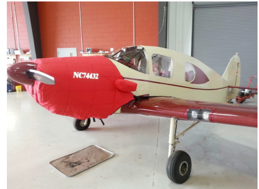
Bellanca Cruisemaster Insulated Engine Cover