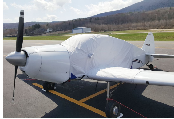
Bellanca Cruisemaster Extended Canopy Cover with 36" Wing Extensions.