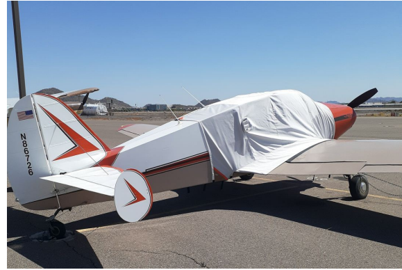
Bellanca 14-13 Cruisair Extended Canopy Cover w/12" Wing Extensions