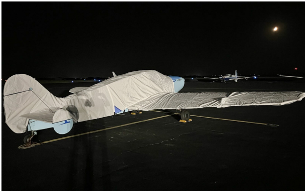
Bellanca Cruisemaster Cover Set

This cover type is made from Silver Acrylic Sunbrella canvas and is 100% lined with a soft and smooth microfiber. Bruce's Custom Covers developed this material combination especially for aircraft protection. The outer material is medium weight and treated for water resistance, UV resistance and anti-static buildup. The inner lining is a very soft and smooth microfiber to prevent scratching. The material is very reflective, and tests show that the cabin interior temperature can be reduced to near-ambient temperature on the hottest of days. It is water, ice and snow repellent, yet breathable to allow moisture to escape from between the cover and the aircraft surface.