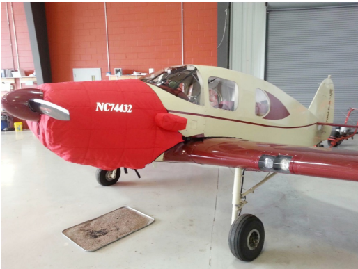
Bellanca Cruisemaster Insulated Engine Cover

This cover type is made from Silver Acrylic Sunbrella canvas and is 100% lined with a soft and smooth microfiber. Bruce's Custom Covers developed this material combination especially for aircraft protection. The outer material is medium weight and treated for water resistance, UV resistance and anti-static buildup. The inner lining is a very soft and smooth microfiber to prevent scratching. The material is very reflective, and tests show that the cabin interior temperature can be reduced to near-ambient temperature on the hottest of days. It is water, ice and snow repellent, yet breathable to allow moisture to escape from between the cover and the aircraft surface.