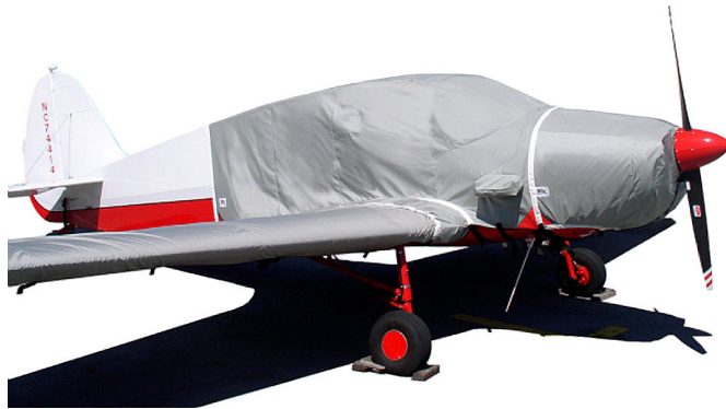
Extended Canopy Cover w/12" Wing Extensions, Engine & Wing Covers

This cover type is made from Silver Acrylic Sunbrella canvas and is 100% lined with a soft and smooth microfiber. Bruce's Custom Covers developed this material combination especially for aircraft protection. The outer material is medium weight and treated for water resistance, UV resistance and anti-static buildup. The inner lining is a very soft and smooth microfiber to prevent scratching. The material is very reflective, and tests show that the cabin interior temperature can be reduced to near-ambient temperature on the hottest of days. It is water, ice and snow repellent, yet breathable to allow moisture to escape from between the cover and the aircraft surface.