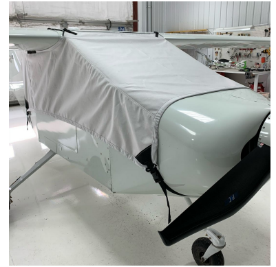
Bede BD-4 Canopy Cover