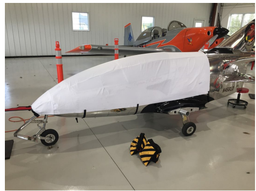
Bede BD-5 Canopy/Nose Cover, test fit cover