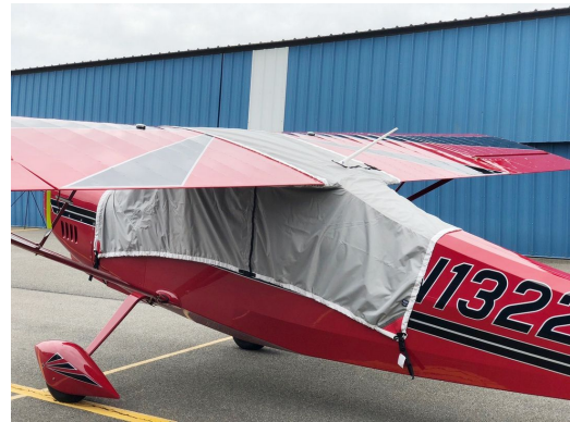
Bellanca Decathlon Travel Canopy Cover