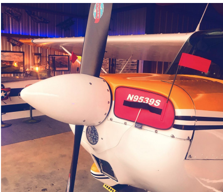
Bellanca Citabria Engine Plugs

Engine Inlet Plugs are custom fit for your Bellanca (American Champion) Decathlon intakes, made with heavy-duty vinyl material, and stuffed with a single block of sculpted urethane foam. Each plug has a zipper that allows the foam to be removed and dried if necessary. Engine plugs have warning flags that are visible from the cockpit or 'remove before flight' streamers sewn onto the face of the plugs. Most plugs are imprinted with the aircraft registration number in black for an extra charge. Storage bag NOT included. Engine plugs may be inserted after flight when the engine is still warm. Engine Inlet Plugs are commonly referred to as Cowl Plugs, Intake Plugs, Cowl Blocks, Engine Blocks, and Engine Bungs.