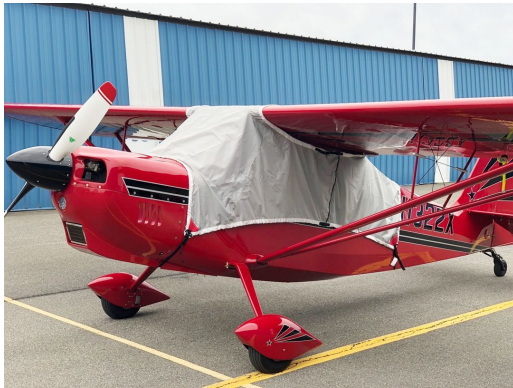
Bellanca Decathlon Travel Canopy Cover

This cover type is made from Silver Acrylic Sunbrella canvas and is 100% lined with a soft and smooth microfiber. Bruce's Custom Covers developed this material combination especially for aircraft protection. The outer material is medium weight and treated for water resistance, UV resistance and anti-static buildup. The inner lining is a very soft and smooth microfiber to prevent scratching. The material is very reflective, and tests show that the cabin interior temperature can be reduced to near-ambient temperature on the hottest of days. It is water, ice and snow repellent, yet breathable to allow moisture to escape from between the cover and the aircraft surface.