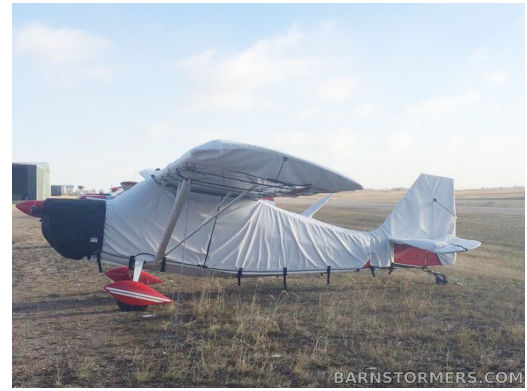
Bellanca Citabria Over-Top Canopy Cover, Extended to Tail, Engine & Wing Covers