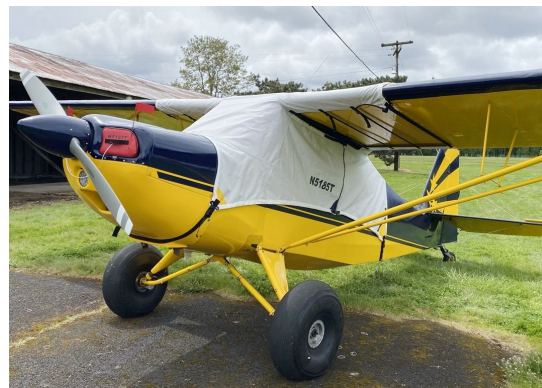
American Champion Citabria canopy cover over the top style, extends to cover gas caps, Engine Plugs