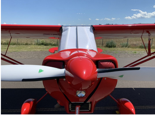
Bellanca Decathlon 8KCAB Heatshield Set with white side out

foam with a silver mylar finish. The semi-rigid design is stiff enough to stand along the inside of the windshield using sun visors or window framing. It folds up flat and easily stores in the included storage sleeve. Some designs may require velcro and suction cups or split right and left sides. A Heatshield is an excellent short-term remedy for cockpit overheating. An external fabric cover is far more effective and practical for long-term protection.