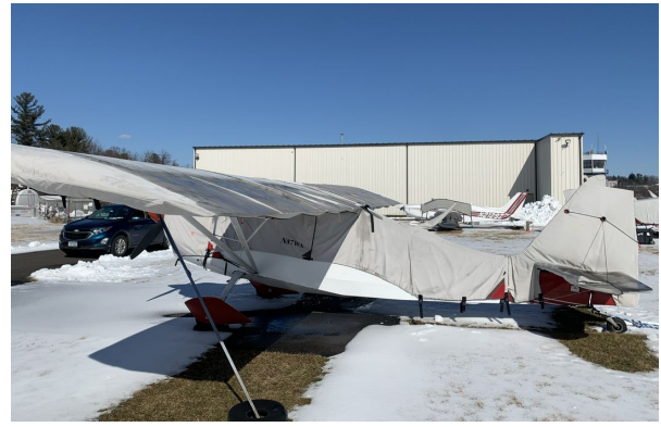
American Champion Decathlon Extended Canopy, Engine, Wing & Empennage Covers