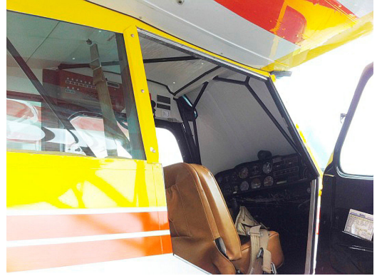
Bellanca Citabria Windshield & Skylight HeatShields