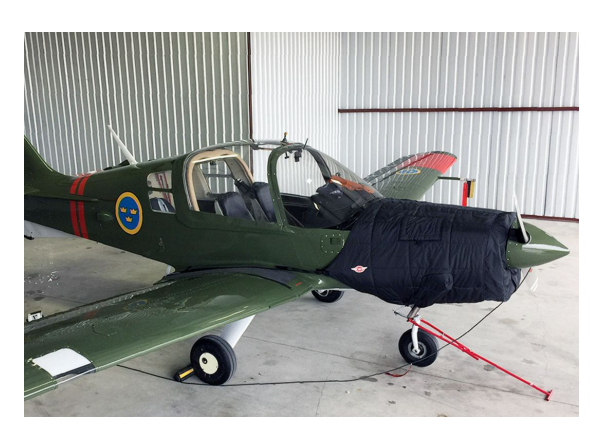
Scottish Aviation Bulldog Insulated Engine Cover