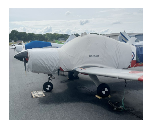
Scottish Aviation Bulldog Canopy & Engine Covers