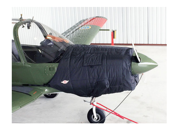
Scottish Aviation Bulldog Insulated Engine Cover

This cover type is made from Silver Acrylic Sunbrella canvas and is 100% lined with a soft and smooth microfiber. Bruce's Custom Covers developed this material combination especially for aircraft protection. The outer material is medium weight and treated for water resistance, UV resistance and anti-static buildup. The inner lining is a very soft and smooth microfiber to prevent scratching. The material is very reflective, and tests show that the cabin interior temperature can be reduced to near-ambient temperature on the hottest of days. It is water, ice and snow repellent, yet breathable to allow moisture to escape from between the cover and the aircraft surface.