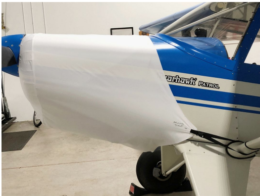
Bearhawk Patrol Engine Cover, test fit cover

This cover type is made from Silver Acrylic Sunbrella canvas and is 100% lined with a soft and smooth microfiber. Bruce's Custom Covers developed this material combination especially for aircraft protection. The outer material is medium weight and treated for water resistance, UV resistance and anti-static buildup. The inner lining is a very soft and smooth microfiber to prevent scratching. The material is very reflective, and tests show that the cabin interior temperature can be reduced to near-ambient temperature on the hottest of days. It is water, ice and snow repellent, yet breathable to allow moisture to escape from between the cover and the aircraft surface.