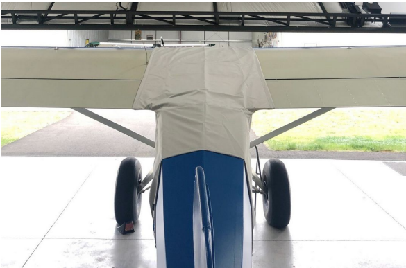
Bearhawk 2-Place Model Canopy Cover

This cover type is made from Silver Acrylic Sunbrella canvas and is 100% lined with a soft and smooth microfiber. Bruce's Custom Covers developed this material combination especially for aircraft protection. The outer material is medium weight and treated for water resistance, UV resistance and anti-static buildup. The inner lining is a very soft and smooth microfiber to prevent scratching. The material is very reflective, and tests show that the cabin interior temperature can be reduced to near-ambient temperature on the hottest of days. It is water, ice and snow repellent, yet breathable to allow moisture to escape from between the cover and the aircraft surface.