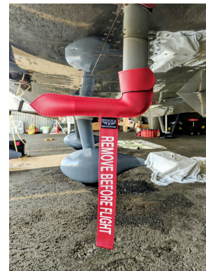
Van's RV-14 Pitot Cover