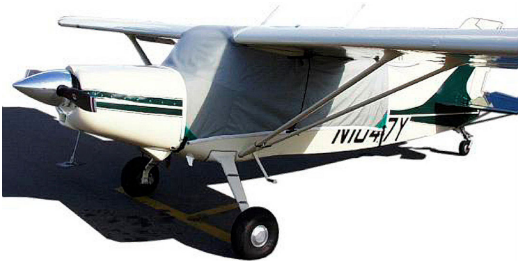
Maule M-7 Standard Canopy Cover