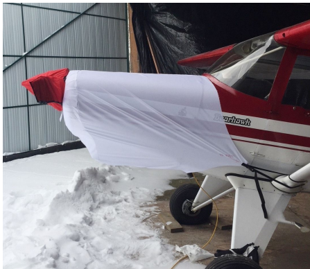
Bearhawk Engine Cover (test fit), Insulated Prop Cover