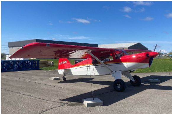
Bearhawk 4-Place Complete Cover Set, BEFORE

WINTER USE MATERIAL - Made with Solution-Dyed Polyester fabric, this option is intended for seasonal use to aid in deicing, rain mitigation, or for occasional travel. The material is lighter and more compact, but more susceptible to UV damage and may have a shorter useful life if used continuously outside than the all-year use material.