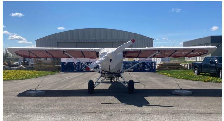
Bearhawk 4-Place Complete Cover Set