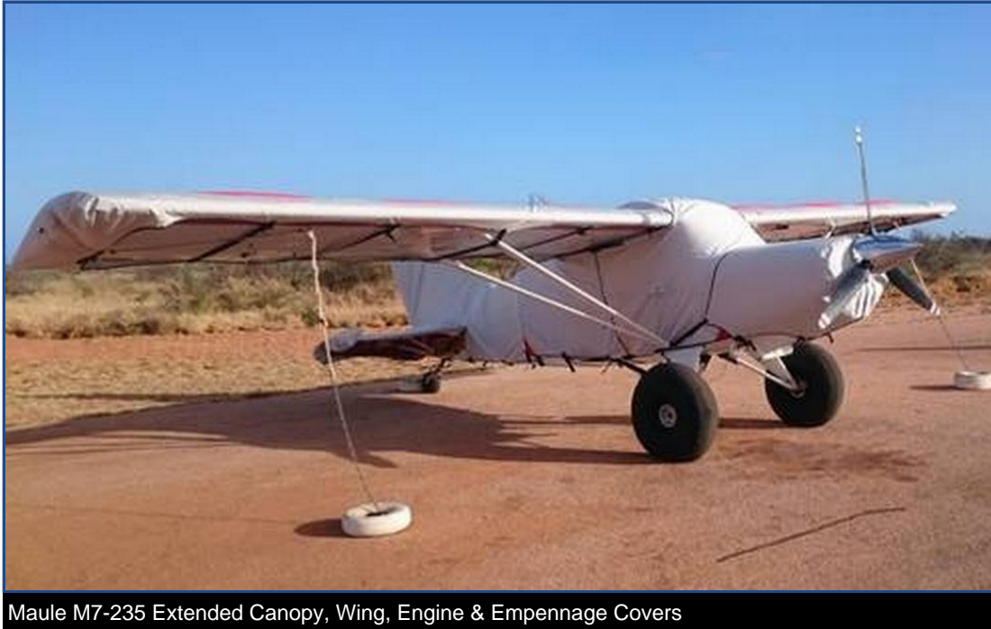
Maule M7-235 Extended Canopy, Wing, Engine & Empennage Covers