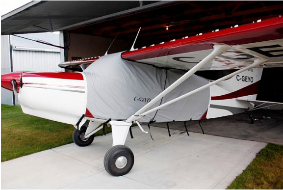
Maule Over-Top Extended Canopy Cover

This cover type is made from Silver Acrylic Sunbrella canvas and is 100% lined with a soft and smooth microfiber. Bruce's Custom Covers developed this material combination especially for aircraft protection. The outer material is medium weight and treated for water resistance, UV resistance and anti-static buildup. The inner lining is a very soft and smooth microfiber to prevent scratching. The material is very reflective, and tests show that the cabin interior temperature can be reduced to near-ambient temperature on the hottest of days. It is water, ice and snow repellent, yet breathable to allow moisture to escape from between the cover and the aircraft surface.