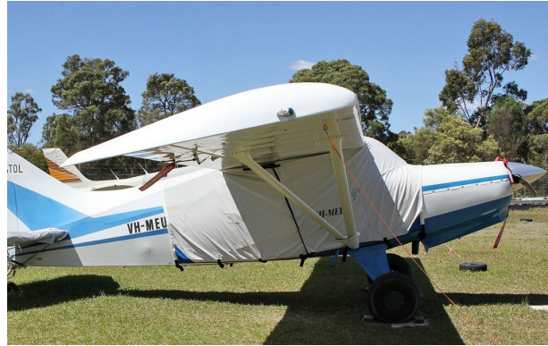
Maule (All Models) Extended Canopy Cover (Over-Top Style), Specify Model & Year