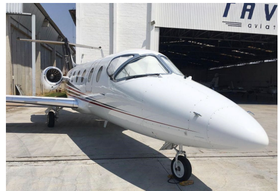
Beechjet Cockpit Heatshields