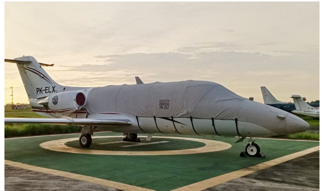
Beechjet Fuselage/Nose Cover