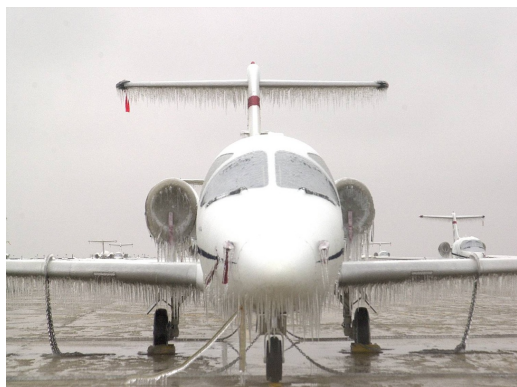
Beechjet 400 Engine Covers

The Hawker Beechcraft Beechjet 400, Hawker 400XP (T1A, T400 Jayhawk) Intake Covers are designed to install easily yet be completely storable. A spring steel hoop is sewn into the hem of each cover, allowing them to be installed without climbing onto the wing or using a stepladder. To store the covers the spring steel hoop folds like a band-saw blade into three nesting rings. Each cover folds into a compact circular bundle which is stored in the included duffle bag, yet they unfold quickly for use. The Tri-Fold Ring cover is made of medium weight nylon which is available in a variety of colors to match the paint trim. Each cover set comes complete with installation and folding instructions. The aircraft's registration number can be silkscreened onto the cover for an extra charge.