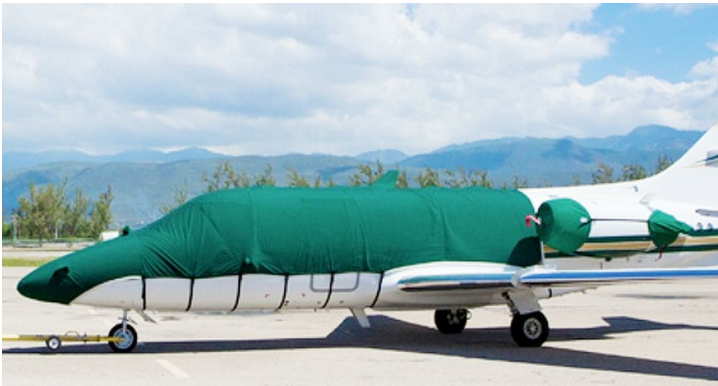
Raytheon Beechjet 400 Fuselage/Nose Cover, Engine Covers

This cover type is made from Silver Acrylic Sunbrella canvas and is 100% lined with a soft and smooth microfiber. Bruce's Custom Covers developed this material combination especially for aircraft protection. The outer material is medium weight and treated for water resistance, UV resistance and anti-static buildup. The inner lining is a very soft and smooth microfiber to prevent scratching. The material is very reflective, and tests show that the cabin interior temperature can be reduced to near-ambient temperature on the hottest of days. It is water, ice and snow repellent, yet breathable to allow moisture to escape from between the cover and the aircraft surface.