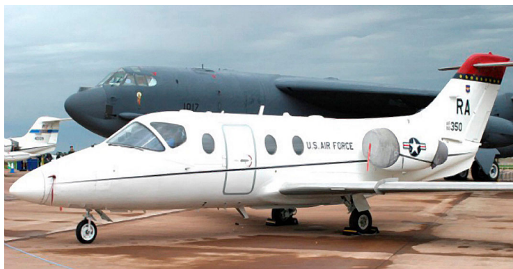
T-1A Jayhawk (Beechjet) Engine & Pitot Cover set