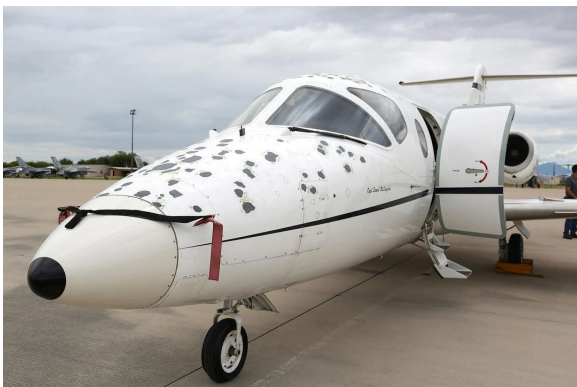
Jayhawk Hail Damage

This cover type is made from Silver Acrylic Sunbrella canvas and is 100% lined with a soft and smooth microfiber. Bruce's Custom Covers developed this material combination especially for aircraft protection. The outer material is medium weight and treated for water resistance, UV resistance and anti-static buildup. The inner lining is a very soft and smooth microfiber to prevent scratching. The material is very reflective, and tests show that the cabin interior temperature can be reduced to near-ambient temperature on the hottest of days. It is water, ice and snow repellent, yet breathable to allow moisture to escape from between the cover and the aircraft surface.