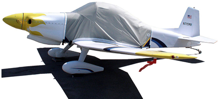
Bushby Mustang Extended Canopy Cover