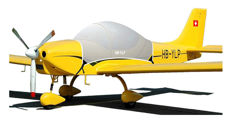
Ikarus Breezer Canopy Cover (illustration)