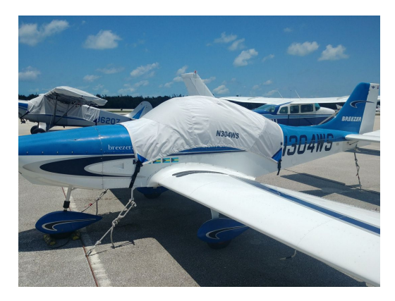
Ikarus Breezer Canopy Cover

This cover type is made from Silver Acrylic Sunbrella canvas and is 100% lined with a soft and smooth microfiber. Bruce's Custom Covers developed this material combination especially for aircraft protection. The outer material is medium weight and treated for water resistance, UV resistance and anti-static buildup. The inner lining is a very soft and smooth microfiber to prevent scratching. The material is very reflective, and tests show that the cabin interior temperature can be reduced to near-ambient temperature on the hottest of days. It is water, ice and snow repellent, yet breathable to allow moisture to escape from between the cover and the aircraft surface.