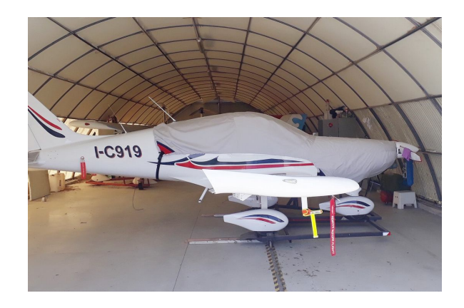
BRM Aero Bristell S-LSA Canopy/Engine Cover

This cover type is made from Silver Acrylic Sunbrella canvas and is 100% lined with a soft and smooth microfiber. Bruce's Custom Covers developed this material combination especially for aircraft protection. The outer material is medium weight and treated for water resistance, UV resistance and anti-static buildup. The inner lining is a very soft and smooth microfiber to prevent scratching. The material is very reflective, and tests show that the cabin interior temperature can be reduced to near-ambient temperature on the hottest of days. It is water, ice and snow repellent, yet breathable to allow moisture to escape from between the cover and the aircraft surface.