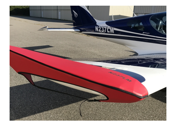
BRM Aero Bristell S-LSA Wingtip Pads