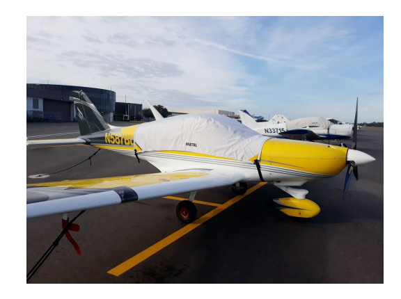
Bristell S-LSA NG5 Canopy Cover