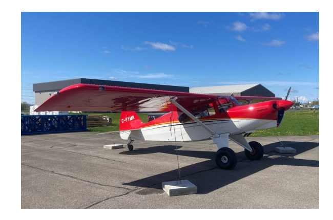
Bearhawk 4-Place Complete Cover Set, BEFORE

WINTER USE MATERIAL - Made with Solution-Dyed Polyester fabric, this option is intended for seasonal use to aid in deicing, rain mitigation, or for occasional travel. The material is lighter and more compact, but more susceptible to UV damage and may have a shorter useful life if used continuously outside than the all-year use material.