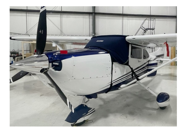
Cessna 182 Windshield Cover, Engine Plugs