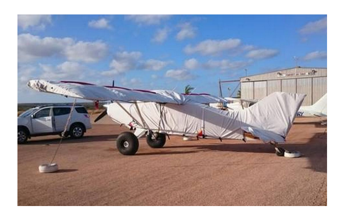
Maule M7-235 Extended Canopy, Wing, Engine & Empennage Covers

This cover type is made from Silver Acrylic Sunbrella canvas and is 100% lined with a soft and smooth microfiber. Bruce's Custom Covers developed this material combination especially for aircraft protection. The outer material is medium weight and treated for water resistance, UV resistance and anti-static buildup. The inner lining is a very soft and smooth microfiber to prevent scratching. The material is very reflective, and tests show that the cabin interior temperature can be reduced to near-ambient temperature on the hottest of days. It is water, ice and snow repellent, yet breathable to allow moisture to escape from between the cover and the aircraft surface.