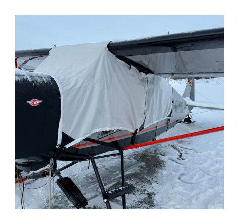
Bushmaster Canopy & Insulated Engine Covers