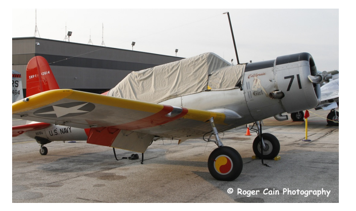
BT-13 Canopy Cover