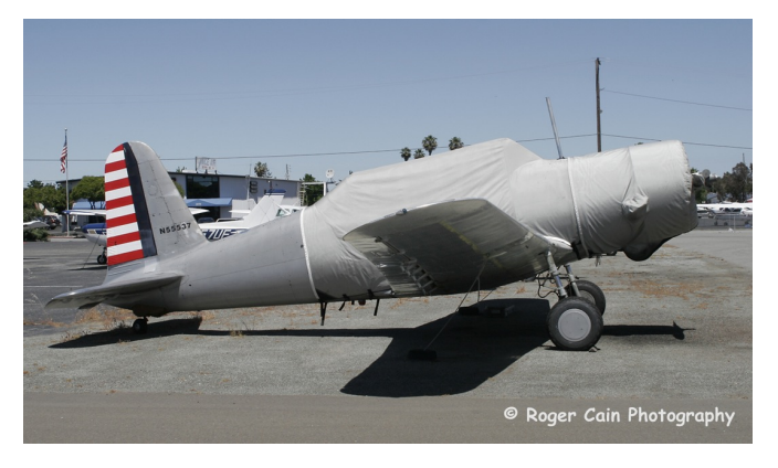
BT-13 Extended Canopy & Engine Covers