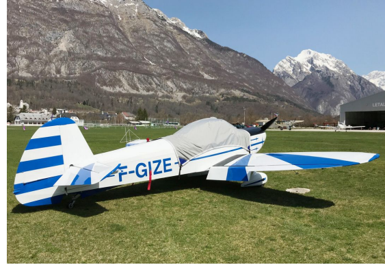
Mudry Cap 10 Canopy Cover