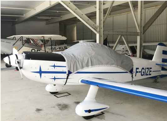
Mudry Cap 10 Travel Cover, Light Weight Travel Canopy Cover

Travel Covers are made with Silver Solution-Dyed Polyester fabric and only lined over the windshield to save weight. The material is lightweight and more compact for easy stowage in the aircraft. The polyester material is water resistant, but only intended for occasional use outside. We also have an ultra lightweight material available for fitted hangar dust covers. For daily outdoor use, the non-travel Sunbrella Cover is the best choice.