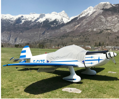
Mudry Cap 10 Canopy Cover

water resistance, UV resistance and anti-static buildup. The inner lining is a very soft and smooth microfiber to prevent scratching. The material is very reflective, and tests show that the cabin interior temperature can be reduced to near-ambient temperature on the hottest of days. It is water, ice and snow repellent, yet breathable to allow moisture to escape from between the cover and the aircraft surface.