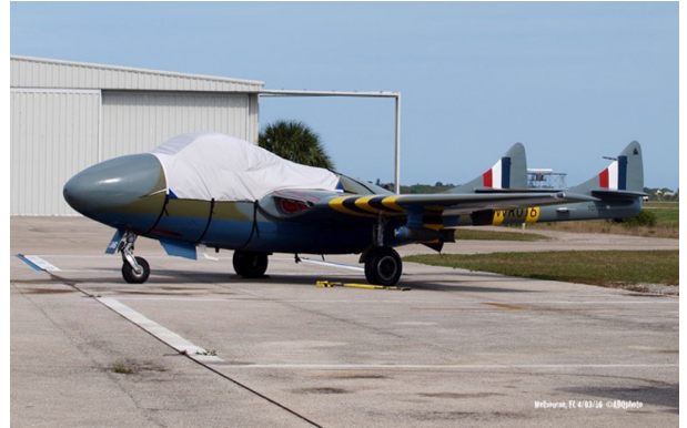
DeHavilland Vampire Canopy Cover