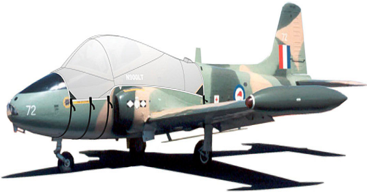
Jet Provost Canopy Cover (Illustration)

This cover type is made from Silver Acrylic Sunbrella canvas and is 100% lined with a soft and smooth microfiber. Bruce's Custom Covers developed this material combination especially for aircraft protection. The outer material is medium weight and treated for water resistance, UV resistance and anti-static buildup. The inner lining is a very soft and smooth microfiber to prevent scratching. The material is very reflective, and tests show that the cabin interior temperature can be reduced to near-ambient temperature on the hottest of days. It is water, ice and snow repellent, yet breathable to allow moisture to escape from between the cover and the aircraft surface.