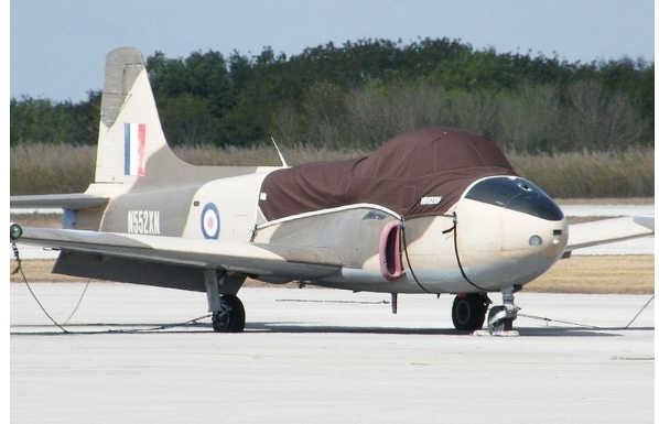
Jet Provost Canopy Cover