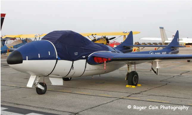
DeHavilland Vampire Canopy Cover, Engine Plugs

Travel Covers are made with Silver Solution-Dyed Polyester fabric and only lined over the windshield to save weight. The material is lightweight and more compact for easy stowage in the aircraft. The polyester material is water resistant, but only intended for occasional use outside. We also have an ultra lightweight material available for fitted hangar dust covers. For daily outdoor use, the non-travel Sunbrella Cover is the best choice.