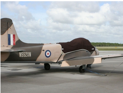
Jet Provost Canopy Cover