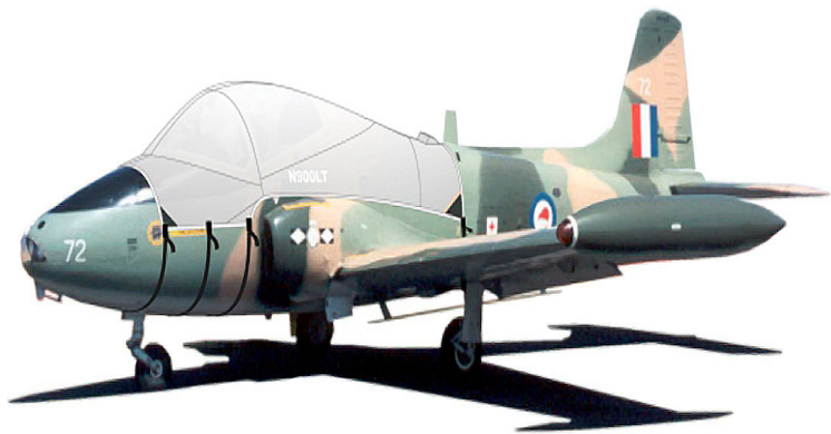
Jet Provost Canopy Cover (Illustration)

Travel Covers are made with Silver Solution-Dyed Polyester fabric and only lined over the windshield to save weight. The material is lightweight and more compact for easy stowage in the aircraft. The polyester material is water resistant, but only intended for occasional use outside. We also have an ultra lightweight material available for fitted hangar dust covers. For daily outdoor use, the non-travel Sunbrella Cover is the best choice.