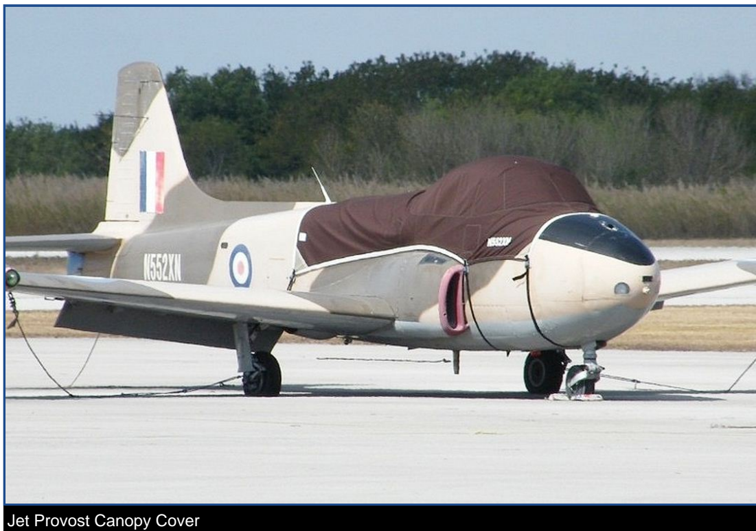
Jet Provost Canopy Cover