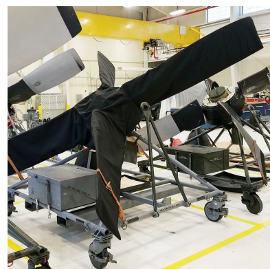
C-130 QEC / Maintenance Cover Set