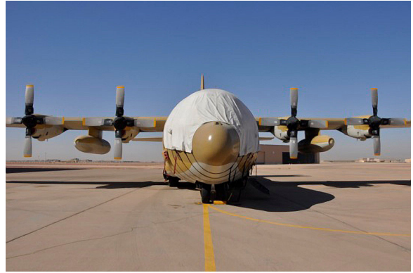
C-130 Cockpit Cover (Windshield/Flight Deck)