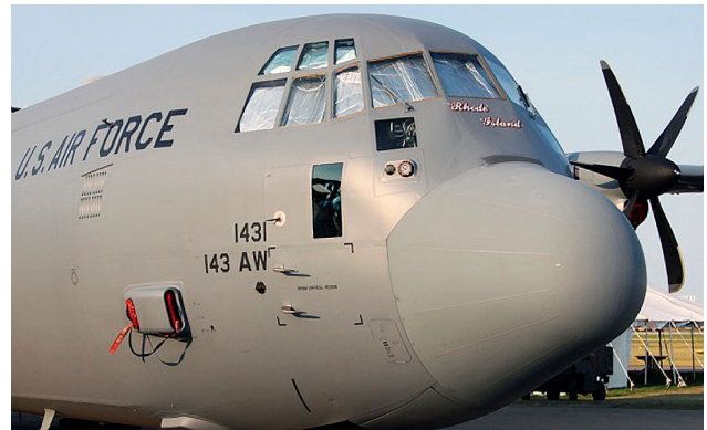
C-130 Cockpit HeatShields