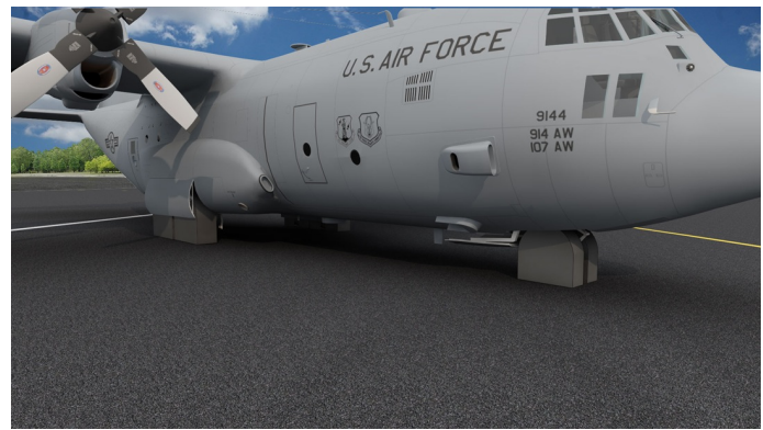
C-130 Tire Covers