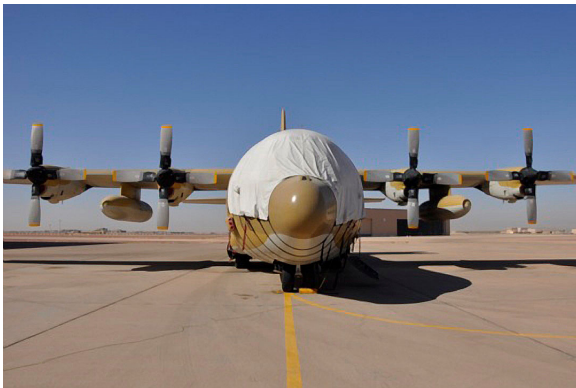
C-130 Cockpit Cover (Windshield/Flight Deck)

This cover type is made from Silver Acrylic Sunbrella canvas and is 100% lined with a soft and smooth microfiber. Bruce's Custom Covers developed this material combination especially for aircraft protection. The outer material is medium weight and treated for water resistance, UV resistance and anti-static buildup. The inner lining is a very soft and smooth microfiber to prevent scratching. The material is very reflective, and tests show that the cabin interior temperature can be reduced to near-ambient temperature on the hottest of days. It is water, ice and snow repellent, yet breathable to allow moisture to escape from between the cover and the aircraft surface.