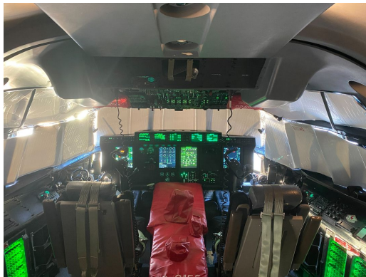
Lookheed C-130 Hercules Flight Deck Heatshield Set

Windshield and Skylight Heatshields are interior sunshades for an aircraft's front windshield and overhead window. The product is a unique composite of closed-cell foam with a silver mylar finish. The semi-rigid design is stiff enough to stand along the inside of the windshield using sun visors or window framing. It folds up flat and easily stores in the included storage sleeve. Some designs may require velcro and suction cups or split right and left sides. A Heatshield is an excellent short-term remedy for cockpit overheating. An external fabric cover is far more effective and practical for long-term protection.