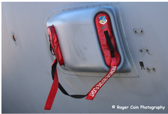
Lockheed C-130 Flight Deck Inlet/Exhaust Plugs