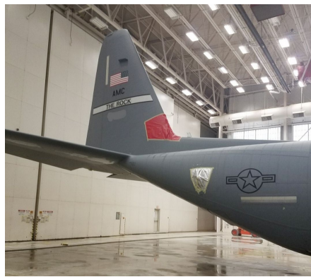
C-130 Vertical De-Ice Boot Cover