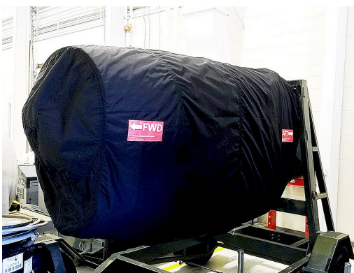
C-130 QEC / Maintenance Cover Set

This cover type is made from Silver Acrylic Sunbrella canvas and is 100% lined with a soft and smooth microfiber. Bruce's Custom Covers developed this material combination especially for aircraft protection. The outer material is medium weight and treated for water resistance, UV resistance and anti-static buildup. The inner lining is a very soft and smooth microfiber to prevent scratching. The material is very reflective, and tests show that the cabin interior temperature can be reduced to near-ambient temperature on the hottest of days. It is water, ice and snow repellent, yet breathable to allow moisture to escape from between the cover and the aircraft surface.