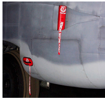
C-130 Heat Exchanger & Exhaust Plugs