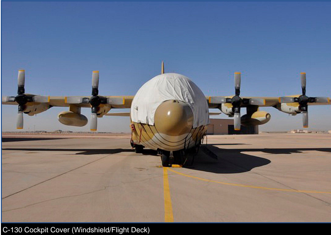
C-130 Cockpit Cover (Windshield/Flight Deck)