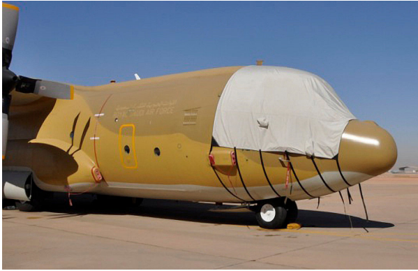
C-130 Cockpit Cover (Windshield/Flight Deck)

escape from between the cover and the aircraft surface.