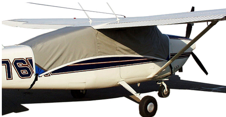
Cessna 206 Standard Canopy Cover

This cover type is made from Silver Acrylic Sunbrella canvas and is 100% lined with a soft and smooth microfiber. Bruce's Custom Covers developed this material combination especially for aircraft protection. The outer material is medium weight and treated for water resistance, UV resistance and anti-static buildup. The inner lining is a very soft and smooth microfiber to prevent scratching. The material is very reflective, and tests show that the cabin interior temperature can be reduced to near-ambient temperature on the hottest of days. It is water, ice and snow repellent, yet breathable to allow moisture to escape from between the cover and the aircraft surface.