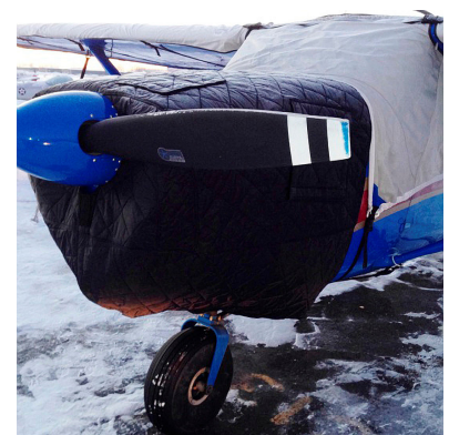
Cessna 205 Insulated Engine Cover