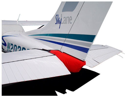
Cessna 182 Tailcone Cover