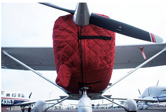
Cessna 172 Insulated Engine Cover, fully enclosed around bottom

This cover type is made from Silver Acrylic Sunbrella canvas and is 100% lined with a soft and smooth microfiber. Bruce's Custom Covers developed this material combination especially for aircraft protection. The outer material is medium weight and treated for water resistance, UV resistance and anti-static buildup. The inner lining is a very soft and smooth microfiber to prevent scratching. The material is very reflective, and tests show that the cabin interior temperature can be reduced to near-ambient temperature on the hottest of days. It is water, ice and snow repellent, yet breathable to allow moisture to escape from between the cover and the aircraft surface.