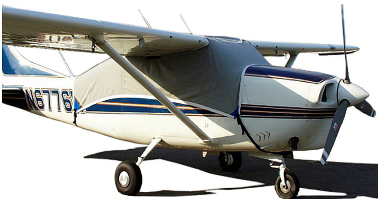
Canopy covers are available in belly strap, snap-on or Over-the-Top Styles