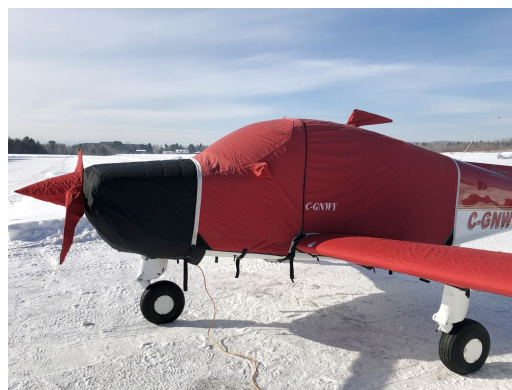
Beech Sundowner Extended Canopy, Wing, Engine & Prop Covers