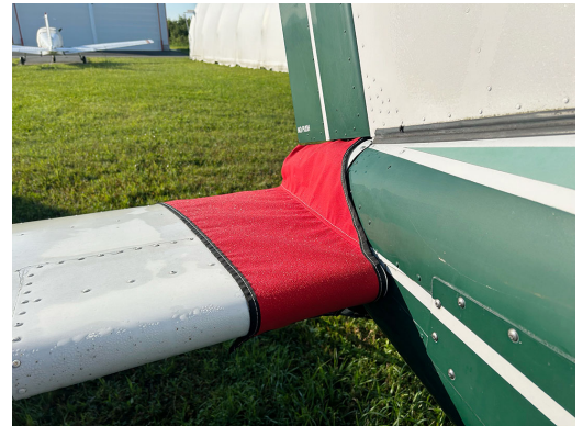
Sundowner C23 Tailcone Cover, fully enclosed