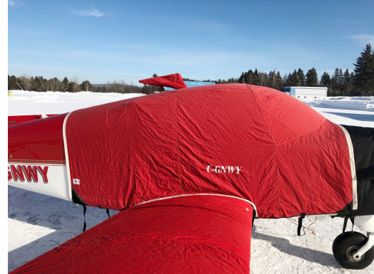
Beech Sundowner Extended Canopy & Wing Covers