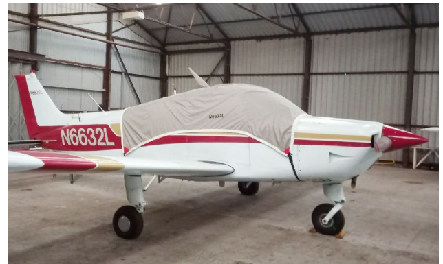
Beech Sundowner Travel Cover, Light Weight Canopy Cover