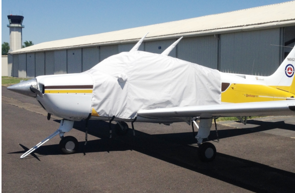
Beech Sundowner Extended Canopy Cover

This cover type is made from Silver Acrylic Sunbrella canvas and is 100% lined with a soft and smooth microfiber. Bruce's Custom Covers developed this material combination especially for aircraft protection. The outer material is medium weight and treated for water resistance, UV resistance and anti-static buildup. The inner lining is a very soft and smooth microfiber to prevent scratching. The material is very reflective, and tests show that the cabin interior temperature can be reduced to near-ambient temperature on the hottest of days. It is water, ice and snow repellent, yet breathable to allow moisture to escape from between the cover and the aircraft surface.