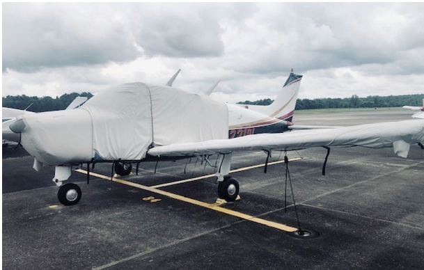
Beech Sundowner Extended Canopy Cover, Fully Enclosed Engine Cover, Wing Covers

WINTER USE MATERIAL - Made with Solution-Dyed Polyester fabric, this option is intended for seasonal use to aid in deicing, rain mitigation, or for occasional travel. The material is lighter and more compact, but more susceptible to UV damage and may have a shorter useful life if used continuously outside than the all-year use material.