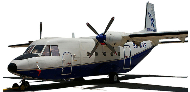
Casa 212 Engine Plugs