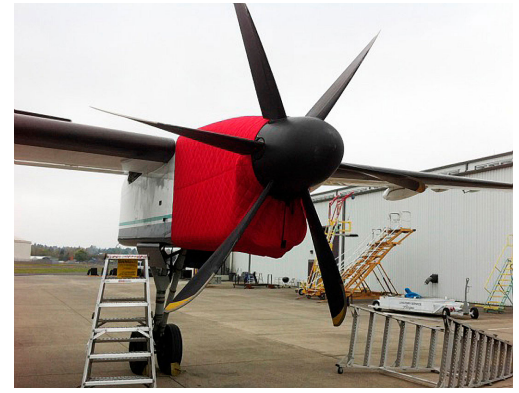
Dash 8-Q400 Insulated Engine Cover