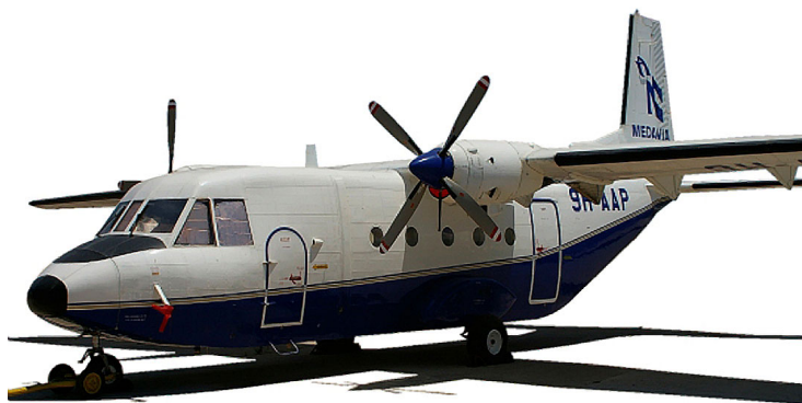
Casa 212 Engine Plugs