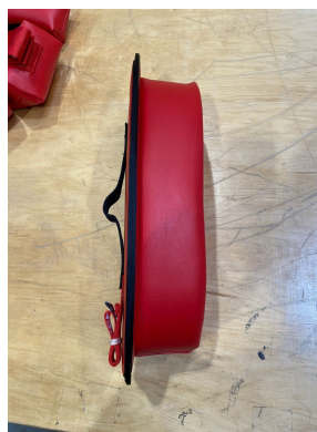
Canadair Challenger 300, 350 APU Exhaust Plug