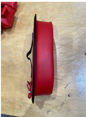
Canadair Challenger 300, 350 APU Exhaust Plug