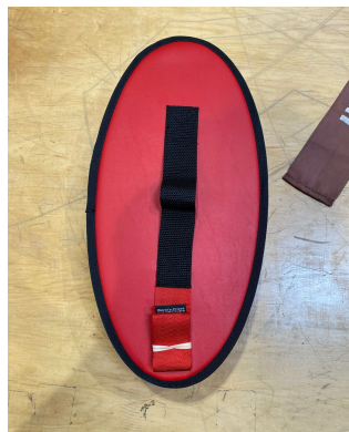
Canadair Challenger 300, 350 APU Exhaust Plug