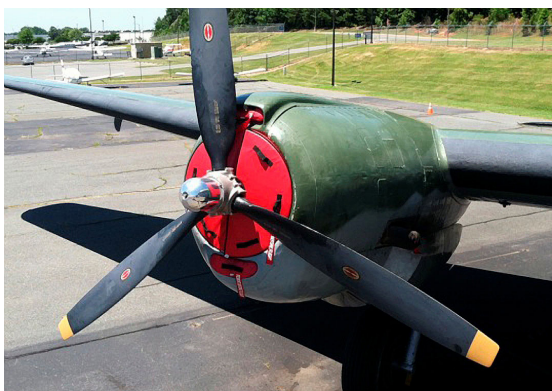
C-46 Radial Engine Intake Plug

Engine Inlet Plugs are custom fit for your Curtiss Wright C-46 Commando intakes, made with heavy-duty vinyl material, and stuffed with a single block of sculpted urethane foam. Each plug has a zipper that allows the foam to be removed and dried if necessary. Engine plugs have warning flags that are visible from the cockpit or 'remove before flight' streamers sewn onto the face of the plugs. Most plugs are imprinted with the aircraft registration number in black for an extra charge. Storage bag NOT included. Engine plugs may be inserted after flight when the engine is still warm. Engine Inlet Plugs are commonly referred to as Cowl Plugs, Intake Plugs, Cowl Blocks, Engine Blocks, and Engine Bunges.