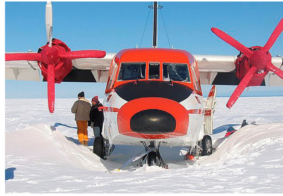
Casa 212 Insulated Engine & Propellor/Spinner Covers