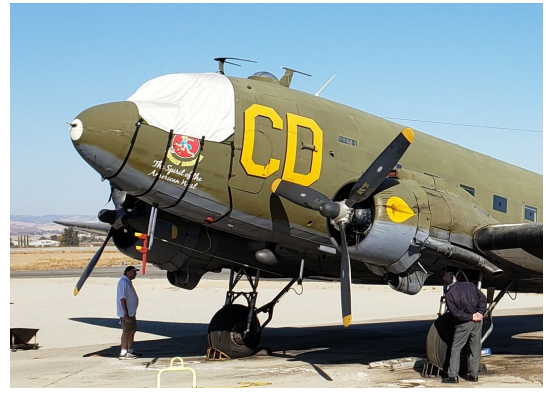
Douglas DC-3 Cockpit Cover