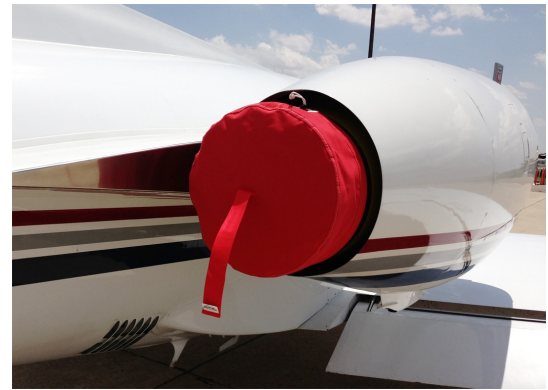
Cessna Citation Stallion Exhaust Cover