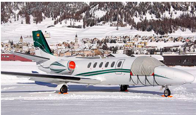
Cessna Citation 550 Windshield Cover

This cover type is made from Silver Acrylic Sunbrella canvas and is 100% lined with a soft and smooth microfiber. Bruce's Custom Covers developed this material combination especially for aircraft protection. The outer material is medium weight and treated for water resistance, UV resistance and anti-static buildup. The inner lining is a very soft and smooth microfiber to prevent scratching. The material is very reflective, and tests show that the cabin interior temperature can be reduced to near-ambient temperature on the hottest of days. It is water, ice and snow repellent, yet breathable to allow moisture to escape from between the cover and the aircraft surface.