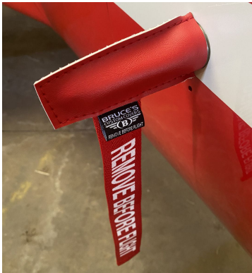
Cessna 501 Angle of Attack Transducer Cover