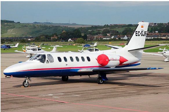
Cessna Citation II Engine Covers, Pitot Covers