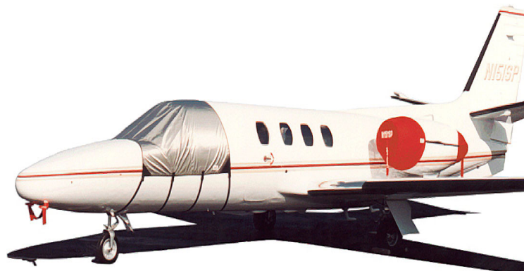
Cessna Citation Windshield, Pitot and Engine Covers