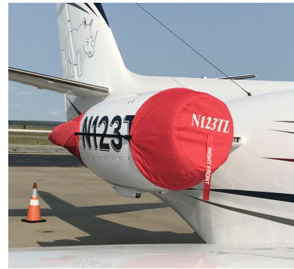
Cessna Citation S/II (S550) Engine Covers (With Tr's)