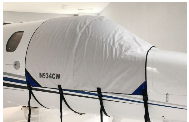
Cessna Citation M2 Cockpit Cover