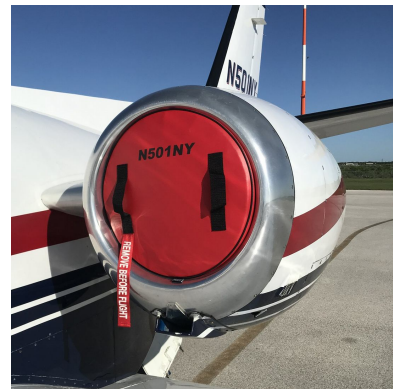
Citation 501 Intake/Exhaust Plug Set