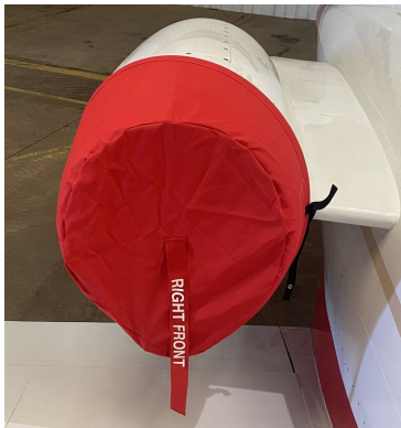
Cessna 501 Engine Covers NO TR's

The Cessna Citation I (500/501) Intake Covers are designed to install easily yet be completely storable. A spring steel hoop is sewn into the hem of each cover, allowing them to be installed without climbing onto the wing or using a stepladder. To store the covers the spring steel hoop folds like a band-saw blade into three nesting rings. Each cover folds into a compact circular bundle which is stored in the included duffle bag, yet they unfold quickly for use. The Tri-Fold Ring cover is made of medium weight nylon which is available in a variety of colors to match the paint trim. Each cover set comes complete with installation and folding instructions. The aircraft's registration number can be silkscreened onto the cover for an extra charge.